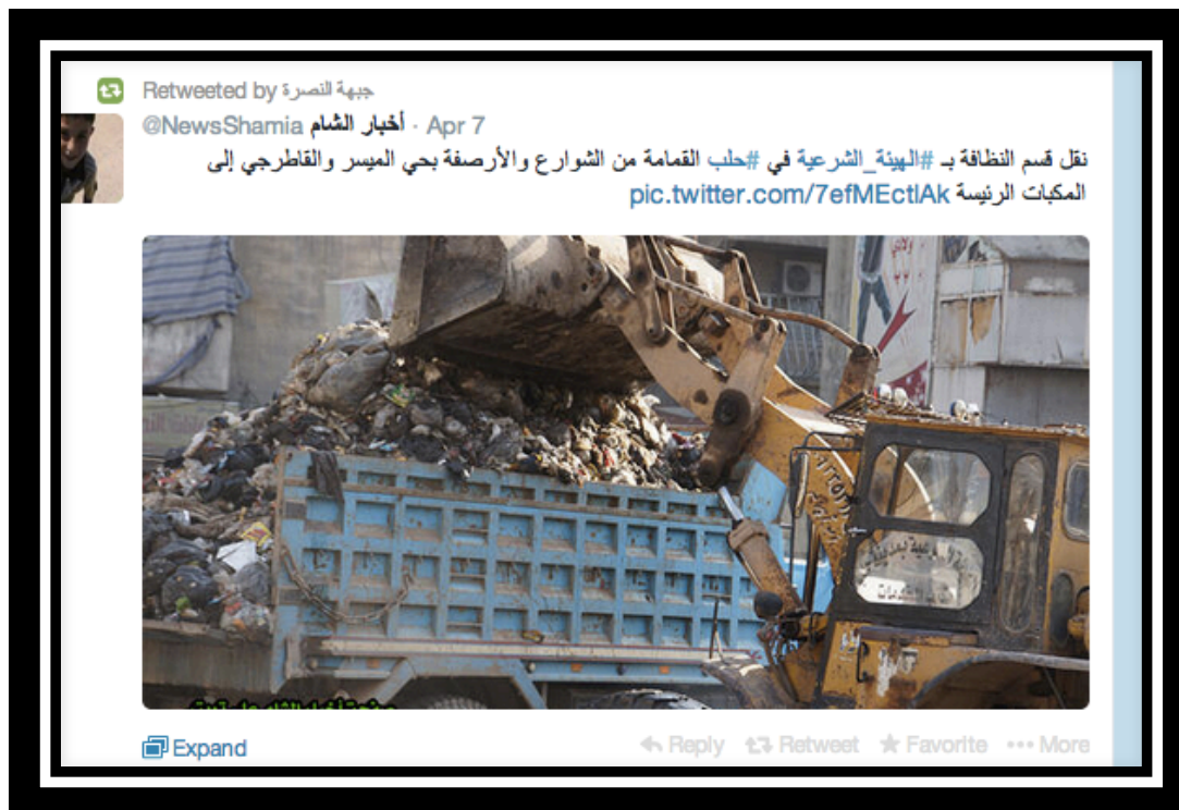
Figure 2: Snap shot of the @JbhatALnusra Twitter page taken on February 22 nd 2014.