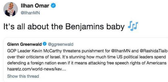
Figure 1: “It’s All About the Benjamins” tweet by Ilhan Omar. 138

A common type of antisemitic trope that mainstream politicians draw upon in political critique is one related to a disproportion of power. For example, in a 2018 tweet, Democrat House Representative Ilhan Omar used this type of trope as a way to criticize lobbying.