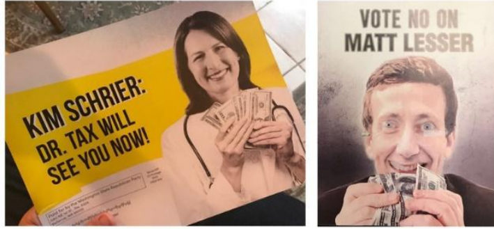
Figures 2 & 3: Fliers depicting Democratic Jewish House and Senate Candidates with money in their hands. 144,145