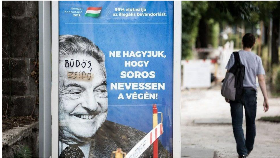
Figure 1: “A poster showing George Soros, saying "Let's not allow Soros to have the last laugh!". Someone has written "dirty Jew" on his forehead”. 38

George Soros, a Hungarian-born American and Jewish figure has had the brunt of antisemitism Orban and his agenda. 39 As a billionaire Jewish philanthropist, he has supported freedom and democracy through his foundation, Open Society Foundation, in over 100 countries around the world. 40 As a result of his efforts, conservative and far-right media have demonized Soros in fears of socialism. 41 From Orban’s advertisement in 2018, it is clear that this advertisement is a backlash against Soros for funding democracy initiatives. This is a calculated strategy employed for his political benefit. He is not targeting Jews, but other new audiences who will politically support him and his ideals. Orban is creating a direct connection between Hungarian political ads and Nazi calls to exterminate the Jews. Right-wing nationalists like Orban propagate and normalize antisemitism. Anti-democratic populism often blames Jews or some group for their troubles, meanwhile, demonizing them as ‘enemy of the people’. Moreover,