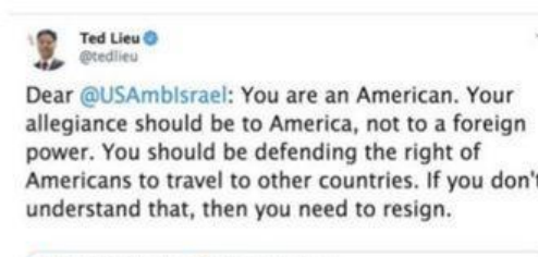
Figure 4. Rep. Ted Lieu's tweet criticizing U.S. Ambassador to Israel David Friedman. 153

This has resulted in Democrats frequently emphasizing how American Jews need to be loyal to the United States. For instance, in 2019, Israel denied Representatives Rashida Tlaib and Ilhan Omar entry into the country, an action former U.S. Ambassador to Israel David Friedman tweeted that he supported. Democrat Representative Ted Lieu tweeted to the ambassador, "You are an American. Your allegiance should be to America, not to a foreign power". 152