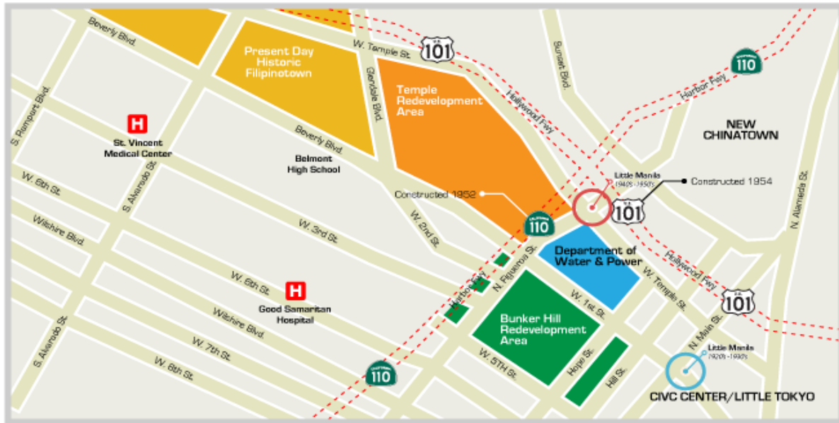
Urban Renewal Projects in Downtown Los Angeles 📍 Little Manila Area - 1920s-1930s 📍 Little Manila Area - 1940s-1950s

Plan called for the demolition of the neighborhood’s buildings to make way for new development. In 1954, the CRA applied for and won a federal aid package of $33 million for the Bunker Hill Urban Renewal Project, with $7 million in matching local funds. After a series of many public hearings lasting a year, the City Council adopted the Bunker Hill Urban Renewal Project in 1959. Five different property owners immediately filed lawsuits, challenging the Redevelopment Plan on the basis of land grabbing and proper compensation, but ultimately the California Supreme Court decided in favor of CRA and upheld the Plan in 1964. The Bunker Hill Urban Renewal Project subsequently leveled hundreds of multi-unit apartments. 66