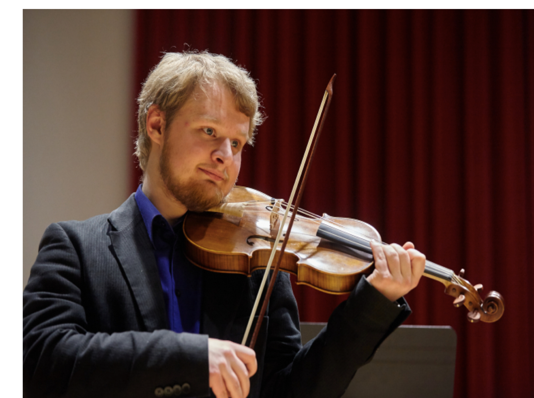
A violin student performs with the Baroque Ensemble.