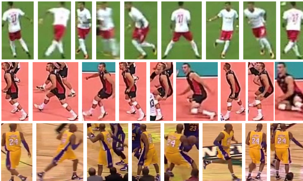
Figure 1.2: Samples of the SportsMOT Dataset.