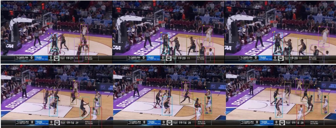
Figure 3.1: Successful post processing re-id case on player with ID 4.

Volleyball Setting. Due to the relatively low number of player camera re-entry cases in volleyball compared to basketball and football, the search space for re-entry players is small. So the post-processing of volleyball is simply based on their disappear and reappear position. For the re-entry player, we select the player in the re-associate candidate who has the closest distance between the disappearing position of candidates and reappears position of the new player for re-identification if their distance is lower than a threshold of 400.