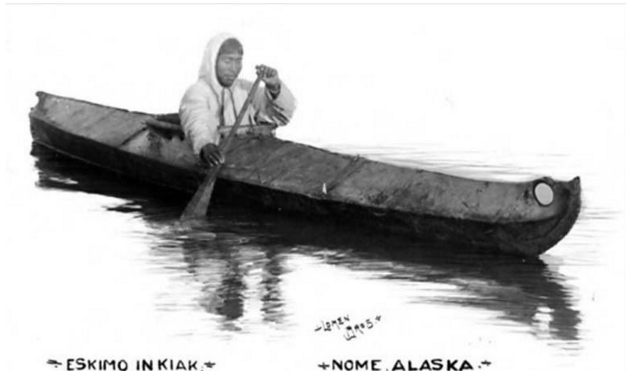
Loman Brothers, Eskimo in Kayak, Nome, Alaska, Ca. 1910 (University of Washington Libraries, Special Collections, unknown).

research. Arima compares the Aleut kayaks with those of the Inuit and offers valuable insight into how differences in design differed from tribe to tribe and region to region. 8 Zimmerly also compares and contrasts the differences in design while observing how those differences result in various performance gains or losses. Additionally, both authors observe that different tribes used different materials with which to build their kayaks. Shorter, wide bodied kayaks covered with caribou skin were able to turn more easily but were unable to go on the open ocean or track as quickly as the long, skinny fur-seal or sea lion covered baidarkas built by the Aleut. 9 What set the Aleut technology apart from their neighbors was the physical and design characteristic of the Aleut kayak.