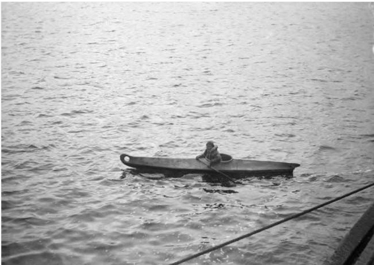
Eskimo in Kayak, Ca. 1890-1900.

...[The Aleut kayak bow] appears perfectly designed to cut cleanly into and through that bow wave so as to avoid an uphill fight. And the stern seems designed with particular attention to avoiding getting dragged down in its own wake. The skin covering of the hull, stretched across the deadrise between the keelson and the chines, took a concave form in the water identical to that of the fastest “cigarette boat” that any speed-seeker of our own century has been able to devise. 34