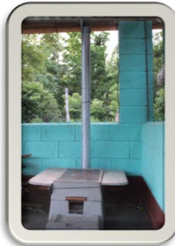
ICS with alternative fuel source

Enhanced efficiency burning chamber, Chimney, Increased Ventilation