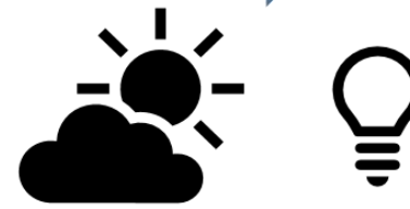
Electric / Solar