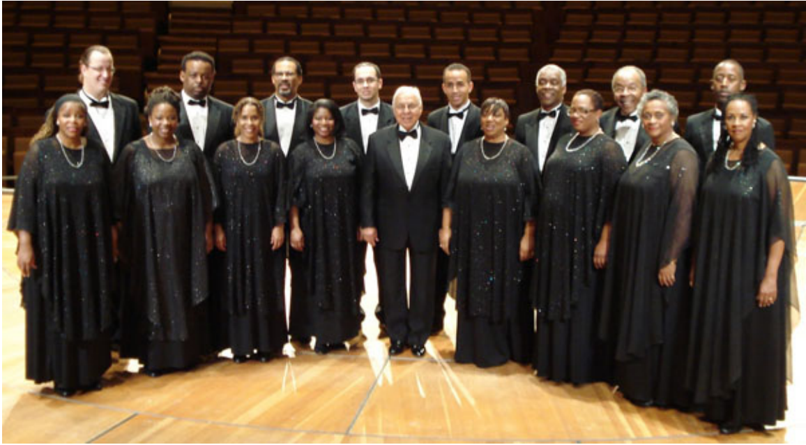
Figure 2. Albert McNeil Jubilee Singers ("Albert McNeil Jubilee Singers." The Official Site of The Albert McNeil Jubilee Singers of Los Angeles.)