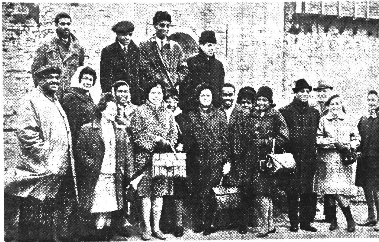
● En dépit de la froidure, les chanteurs noirs et leurs hôtes ont bien voulu poser un instant devant la Cité.

AINSI que nous l'avons annoncé, l'ensemble des « Los Angeles Jubilee Singers » donnera un récital ce soir, au théâtre. Ce concert s'inscrit dans le cadre d'une tournée que les chanteurs noirs américains effectuent cette année en France.