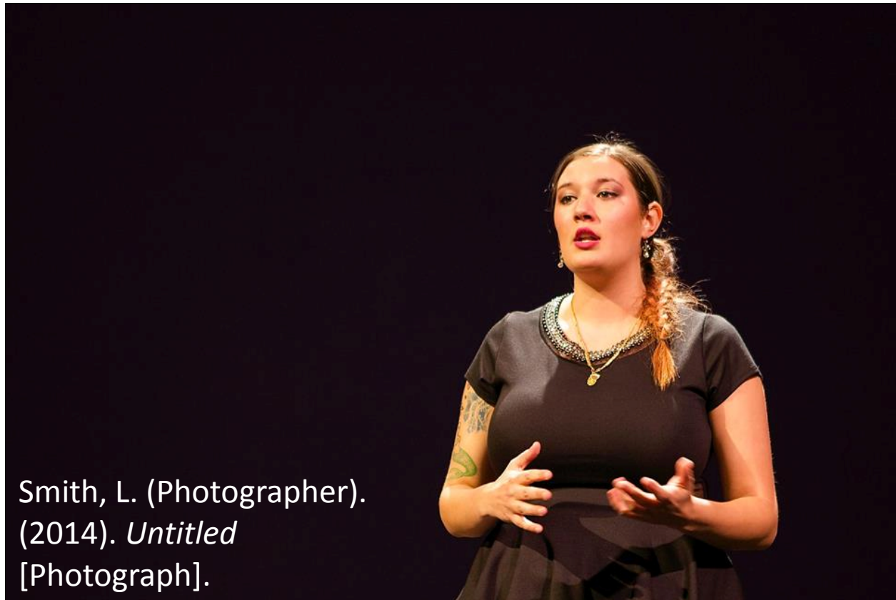
Smith, L. (Photographer). (2014). Untitled [Photograph].