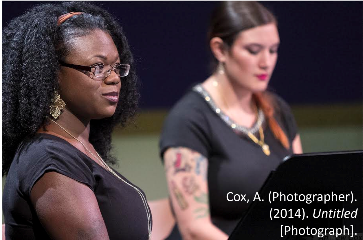
Cox, A. (Photographer). (2014). Untitled [Photograph].