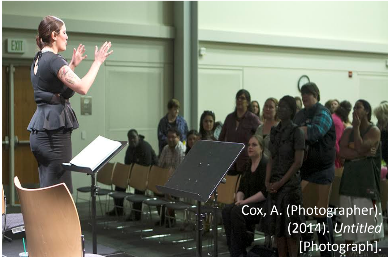
Cox, A. (Photographer). (2014). Untitled [Photograph].