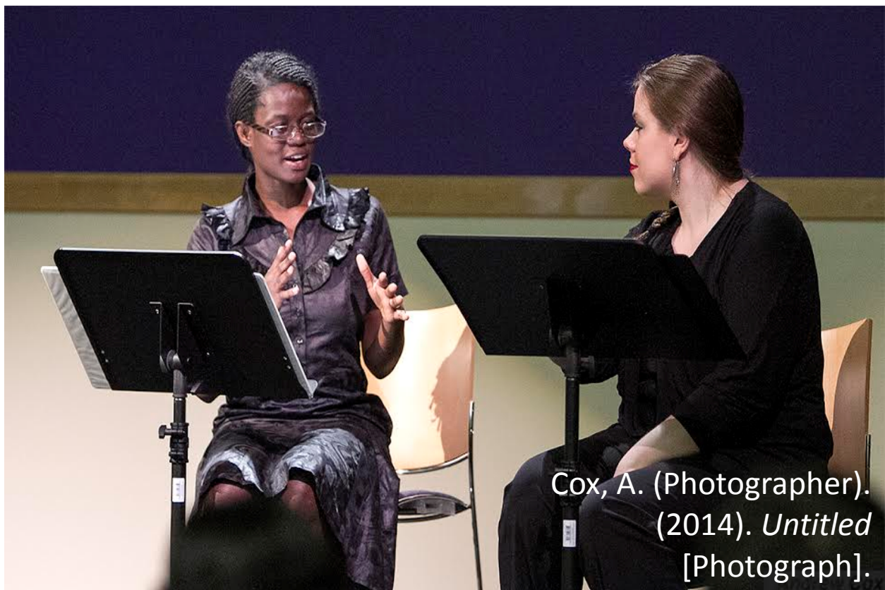
Cox, A. (Photographer). (2014). Untitled [Photograph].