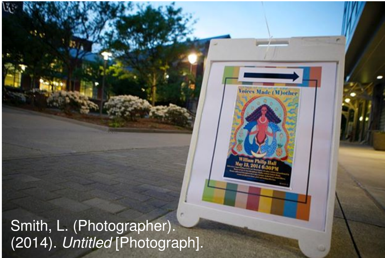
Smith, L. (Photographer). (2014). Untitled [Photograph].