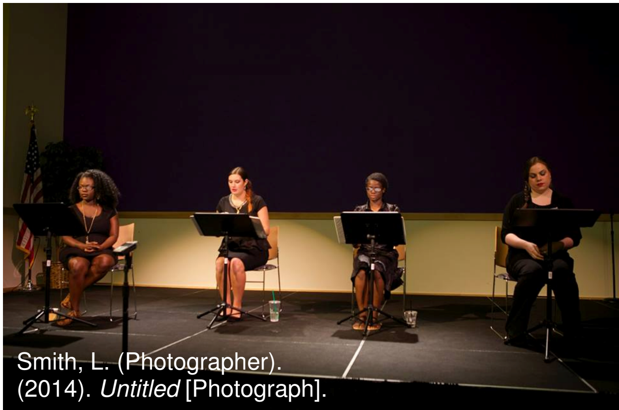
Smith, L. (Photographer). (2014). Untitled [Photograph].