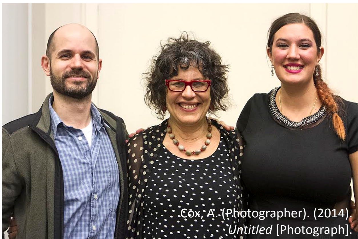
(2014). Untitled [Photograph].