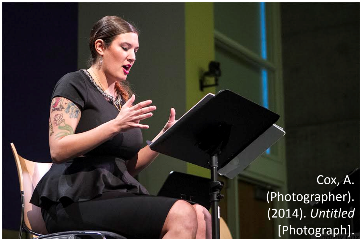
Cox, A. (Photographer). (2014). Untitled [Photograph].