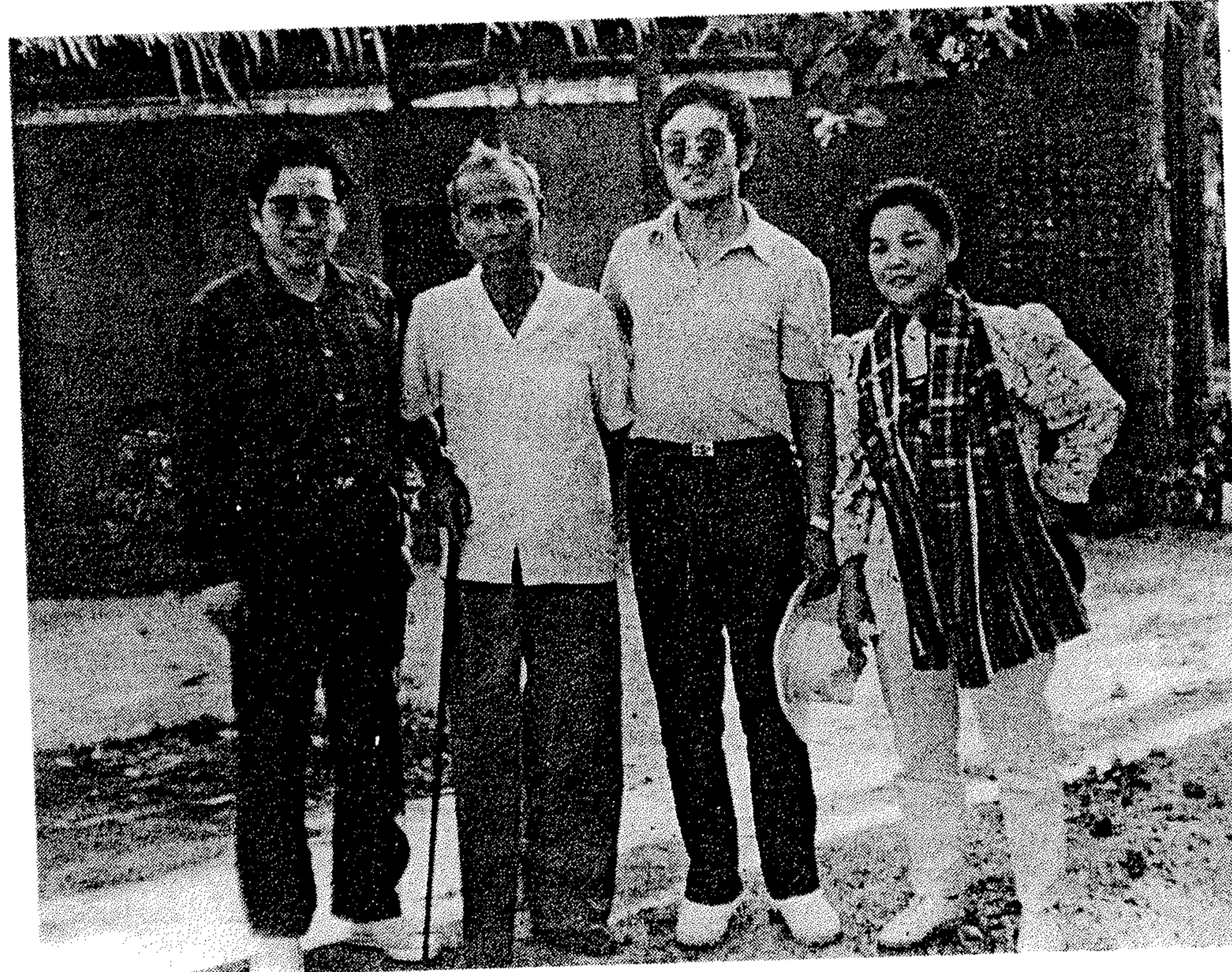
Ta Mok with Thai business associates shortly before his arrest

PLANS to charge Khmer Rouge leaders Khieu Samphan, Nuon Chea and Ta Mok with genocide could founder on a technicality, say legal experts.