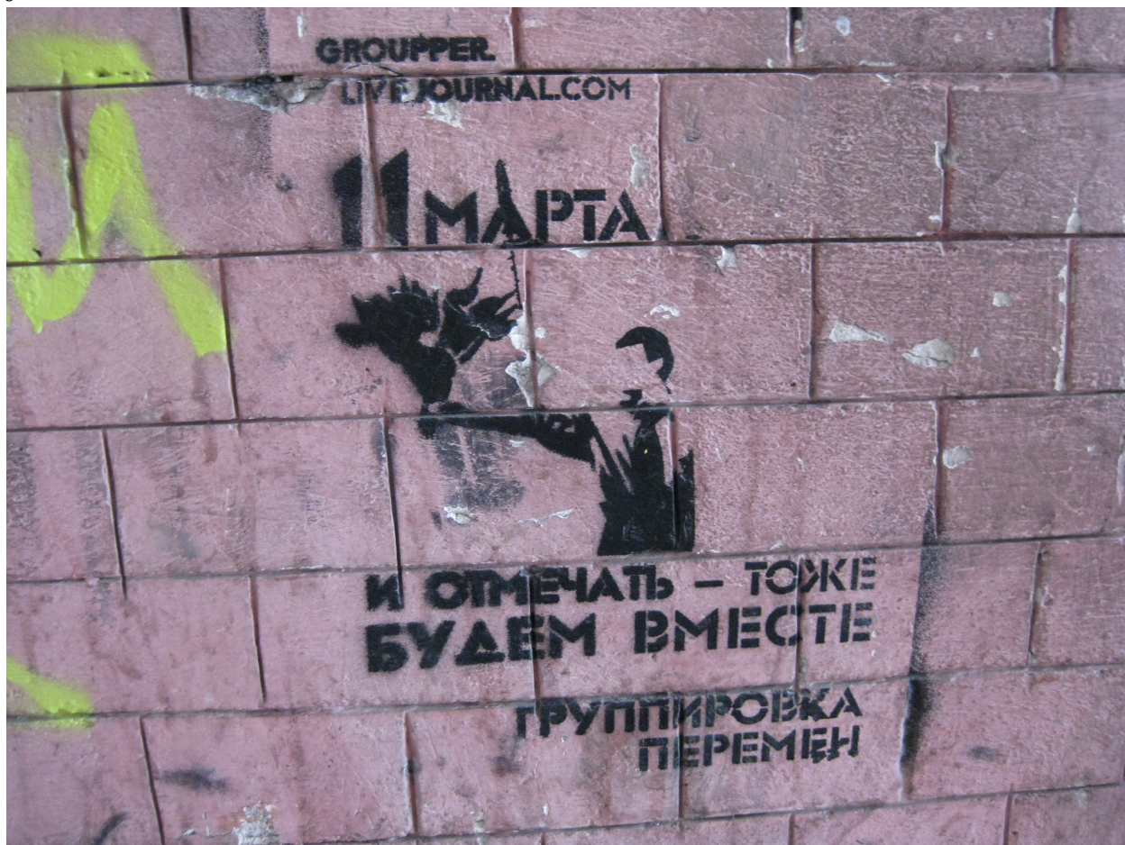
Stencil, St. Petersburg. Advertisement for political blog grouper.livejournal.com and protest action on March 11. Photographed on July 2012.