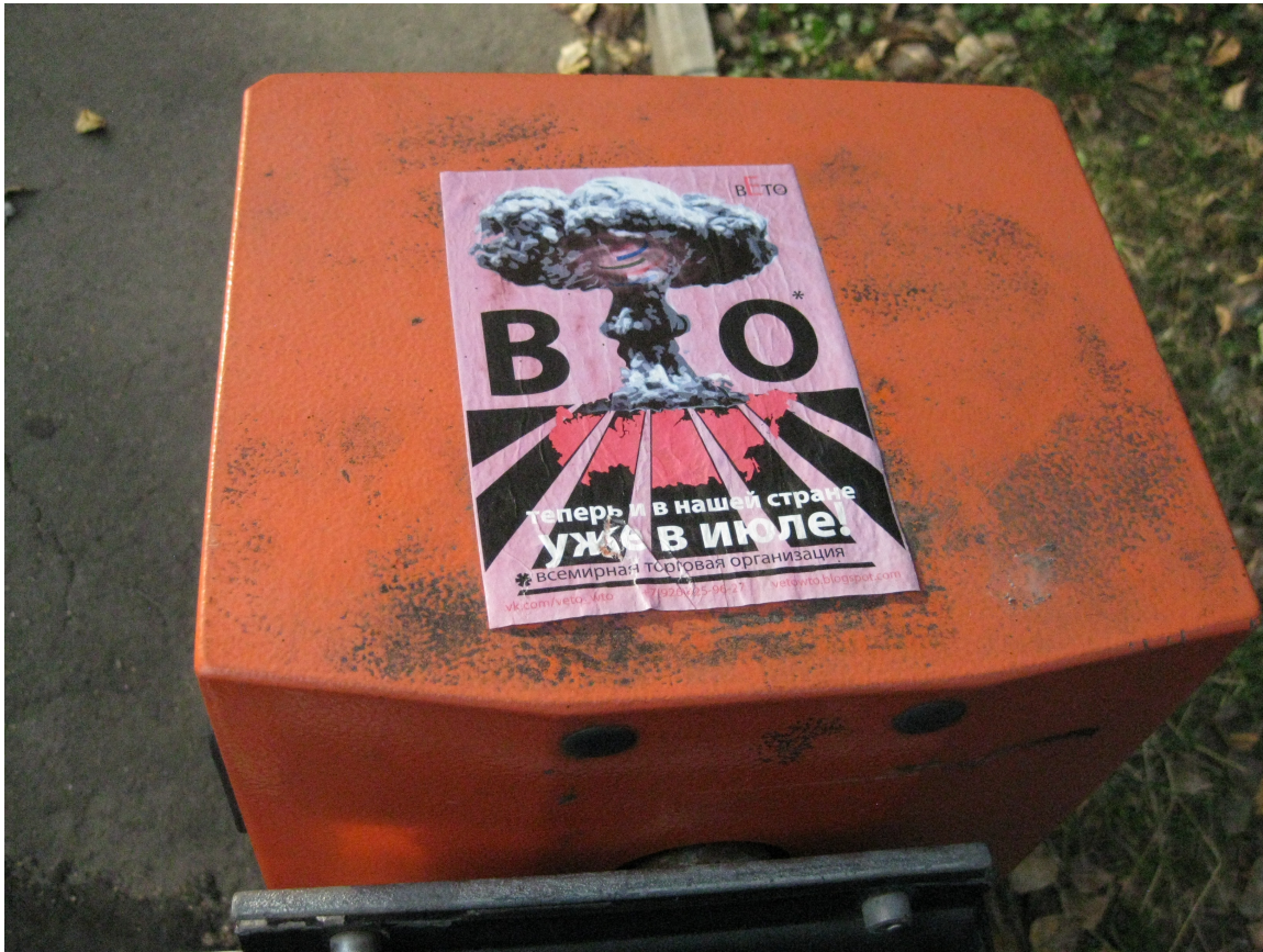
Anti-WTO poster pasted on outdoor electrical box near Moscow State University, July 30, 2012.