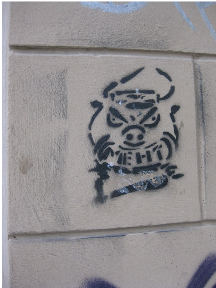
Stencil of pig in police officer's hat, with the Russian slang word for "cop" in the place of the teeth, spray painted in black on wall in Petrogradskii District. St. Petersburg, July 18, 2012.