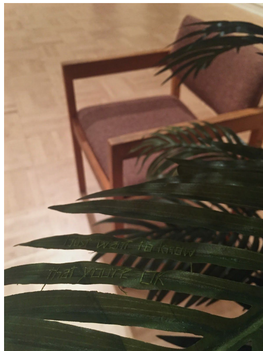
Fig. 10. Ross-Gotta, Cicelia, I Love You Are You Okay , 2017.