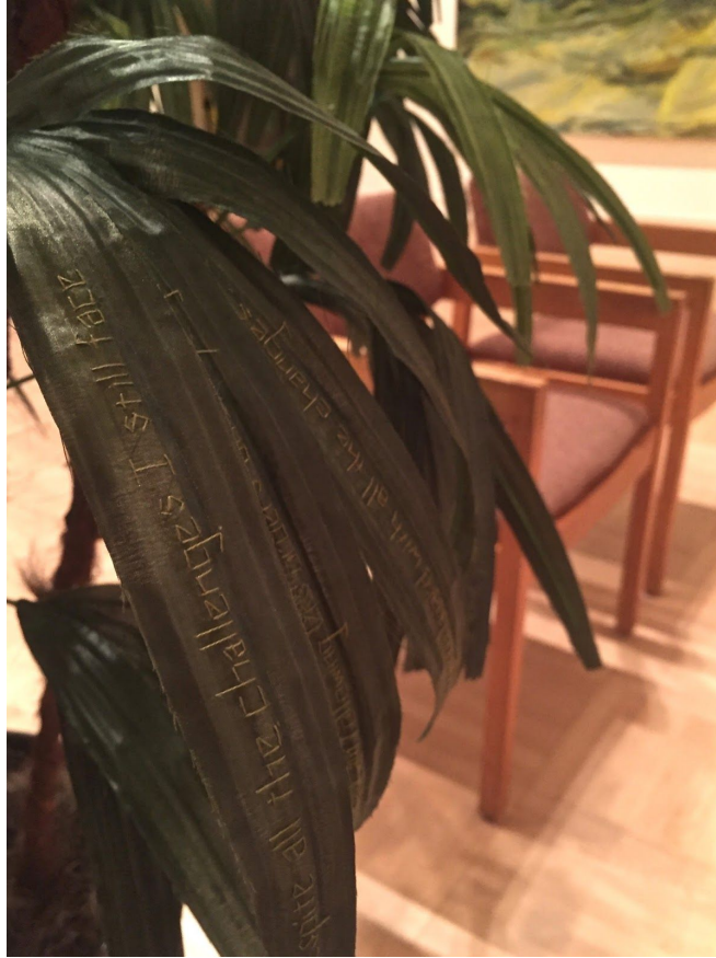
Fig. 11. Ross-Gotta, Cicelia, I Love You Are You Okay , 2017.