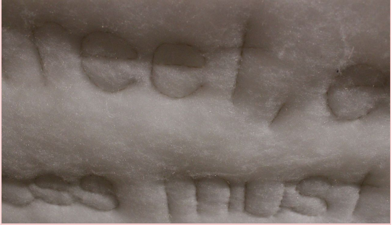
Fig. 8. Ross-Gotta, Cicelia, The Better Choice , 2017.