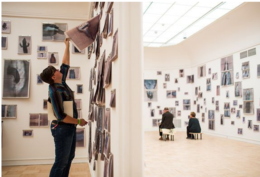
Fig. 2. Hamilton, Ann. The common SENSE , 2014. Photo credit: Dan Bennett. Ann Hamilton Studio. Accessed May 07, 2017. http://www.annhamiltonstudio.com/projects/the_common_SENSE.html .