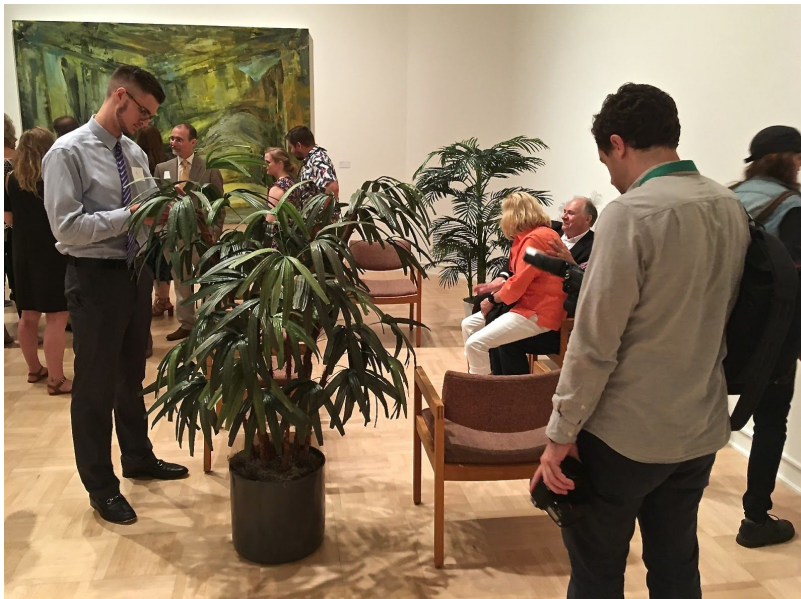
Fig. 12. Ross-Gotta, Cicelia, I Love You Are You Okay , 2017.