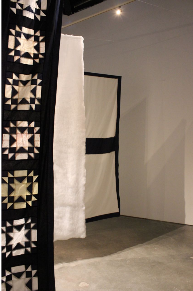
Fig. 5. Ross-Gotta, Cicelia, The Better Choice , 2017.