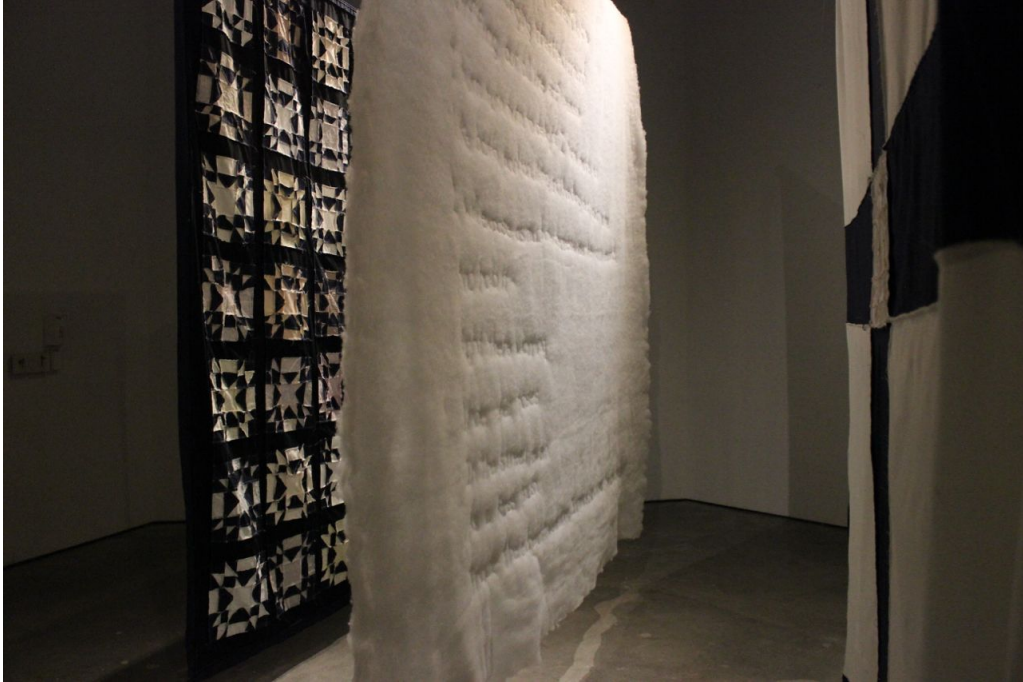
Fig. 6. Ross-Gotta, Cicelia, The Better Choice , 2017.