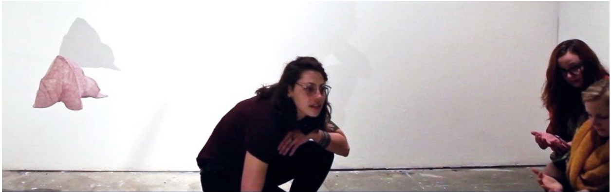
Fig. 4. Ross-Gotta, Cicelia, Even The Mountains Long To Be Held , performance film still, 2016.