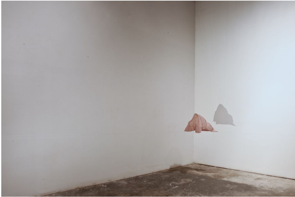
Fig. 3. Ross-Gotta, Cicelia, Even The Mountains Long To Be Held , 2016.