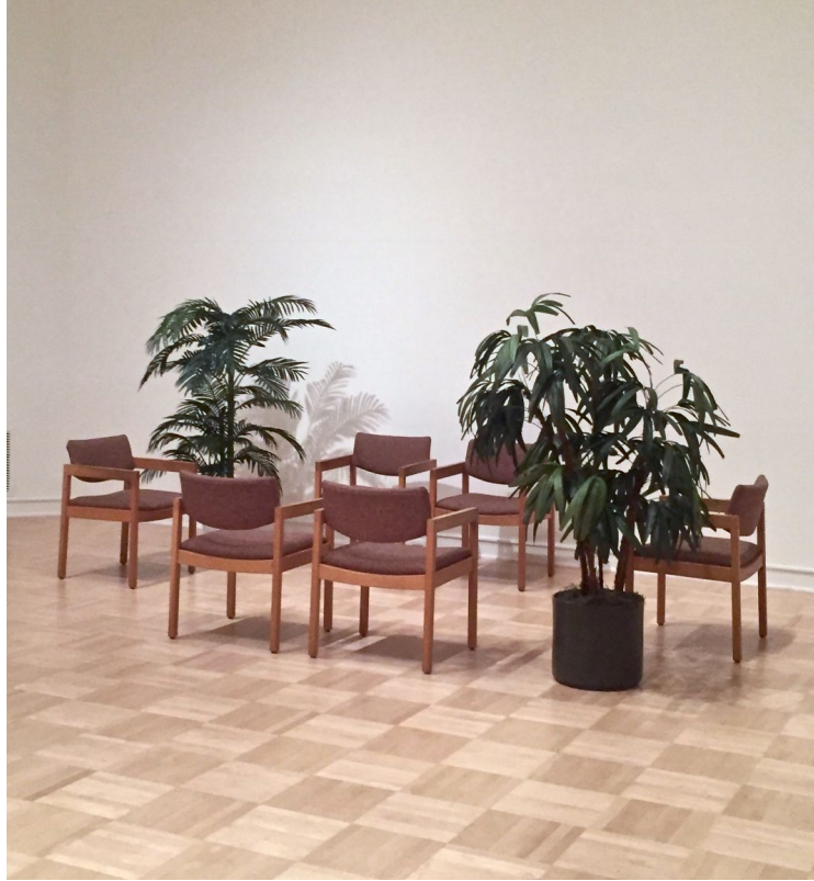
Fig. 9. Ross-Gotta, Cicelia, I Love You Are You Okay , 2017.