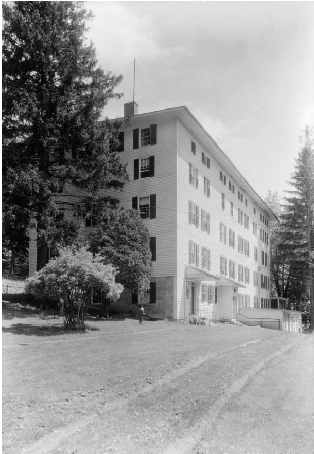
Fig. 4. West (rear) and north exterior, North Family Dwelling House, Mount Lebanon, New York, 1818–63 (demolished 1973), photo 1930.

the woodwork, as well as the location of the woodwork and other architectural elements, appear to represent accurately those of the original room. The entrance door, closet door, and two windows correspond to their original locations in the North Family Dwelling. A window on the wall opposite the entrance door is missing, however.