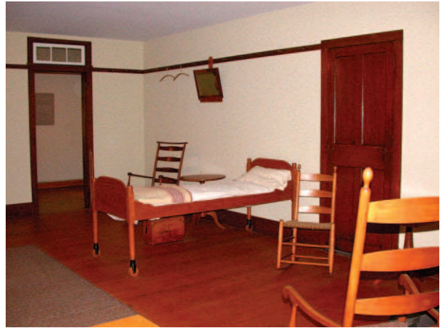
Fig. 5. Sisters' Retiring Room as installed at the Philadelphia Museum of Art, 2005.

on all the windows of the dwelling house, “the first that have been put on a dwelling house in this village.” 4 In January 1855, carpenters cut windows over all the doors in the North Family’s main dwelling so air could circulate from the halls into the retiring rooms (fig. 5). 5 Transoms were common in large institutional structures, such as hospitals, where good air circulation was considered vital to the health of the patients. By the 1860s, sisters throughout Mount Lebanon applied leather panels to the risers of staircases in dwelling houses in order to protect the wood from being gouged by heels. 6