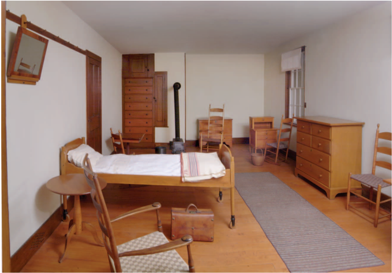
Fig. 1. Sisters' Retiring Room, Mount Lebanon, New York, ca. 1845, as installed at the Philadelphia Museum of Art, 2005.

mid-twentieth-century interpretation of Shaker design.