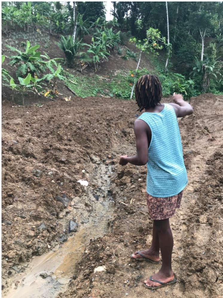
Figure 8 Interviewee demonstrating changes to the natural water system

“The water will destroy everything with landslides. The water is trying to find another way to go, another direction, not the direction that the project is trying to manipulate it to go. The water problem will be big and wash away everything in a few years.”