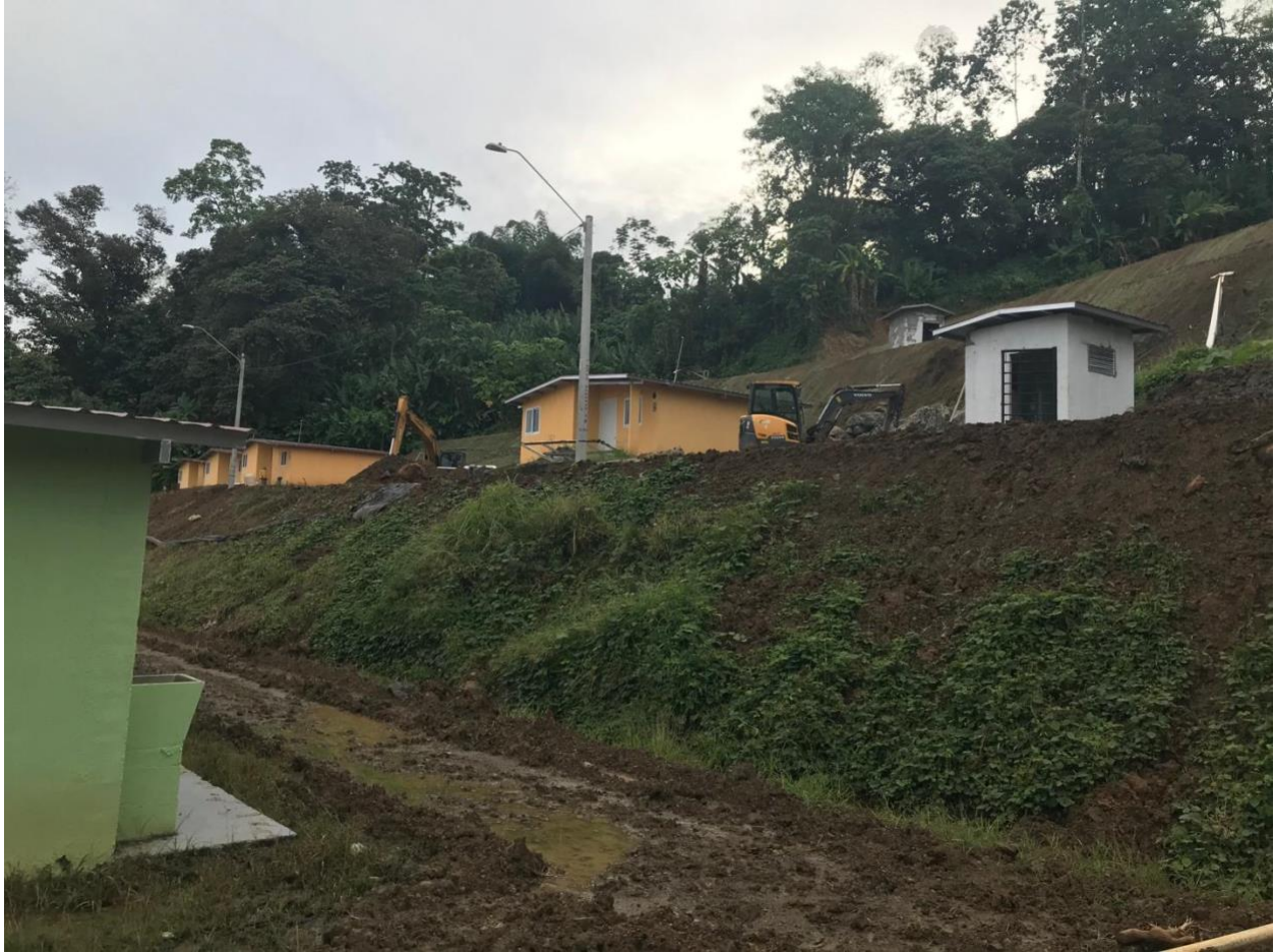
Figure 7 Image of tiers on which rows of houses are placed

Whether respondents were in support of the project or not, the issue of landslides was commonly reported in association with its development as demonstrated below.