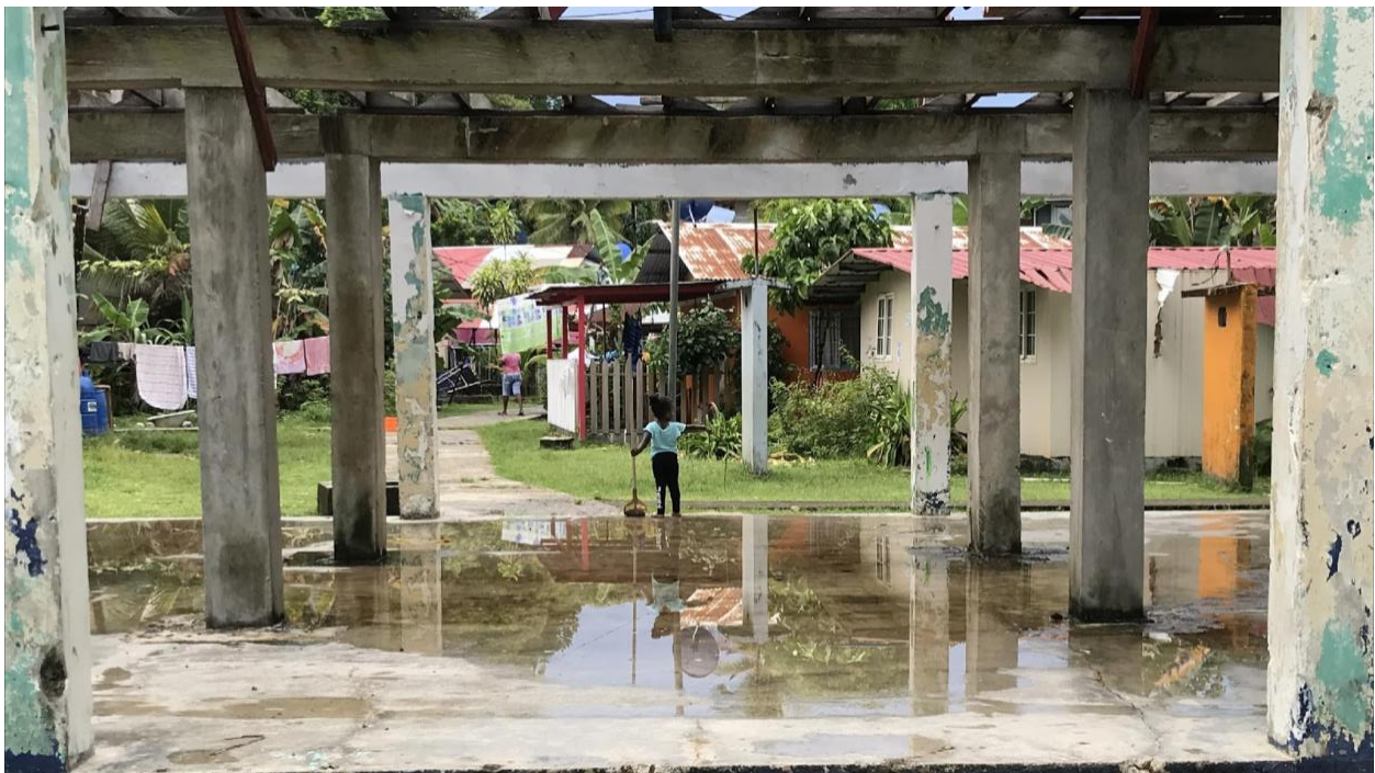
Figure 21 Youth of Bastimentos playing

study primarily focuses on developments on Isla Bastimentos, EPTE is a large-scale event occurring across Panamá. The results of this case study demonstrate the socioecological repercussions faced by one community, which can shed light on the governance behind the initiative to suggest possible state-wide outcomes. Greater attention to the experiences of other communities affected by EPTE can help surface the injustices of the project.