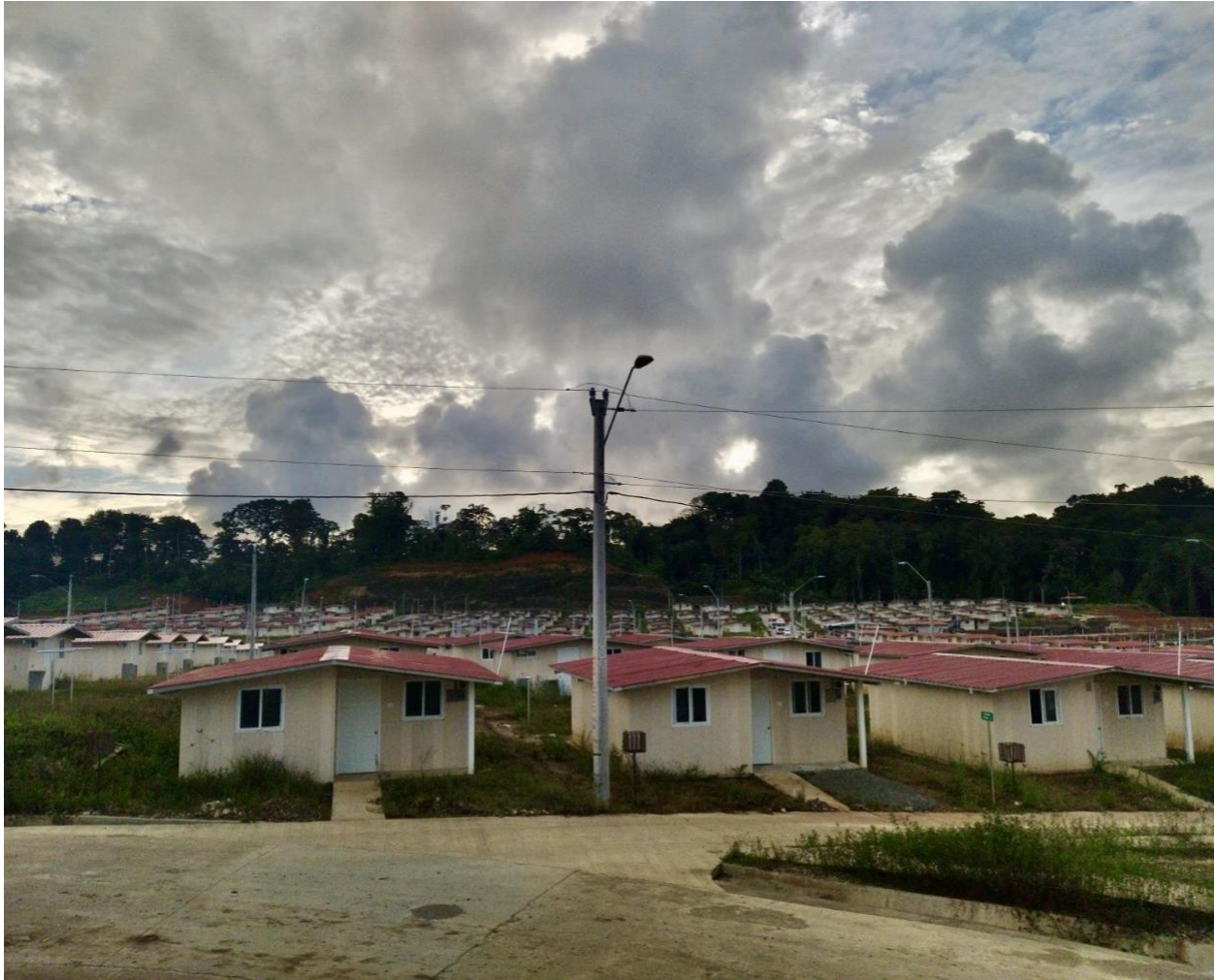
Figure 4 Image of EPTE housing

This study centers EPTE as an environmental justice issue by examining the perceptions and experiences of Black and Indigenous residents of Bastimentos living near the project, displaced by the construction of the project, and those subject to moving to the resettlement site. Findings suggest that EPTE has restricted self-determination by prescribing a managed retreat which threatens Black and Indigenous claims to territory, and associated cultural knowledge systems. I will begin by providing background information with a brief historical and ethnographic description of the Bocas del Toro Archipelago, the increasing emergence of tourism in the region,