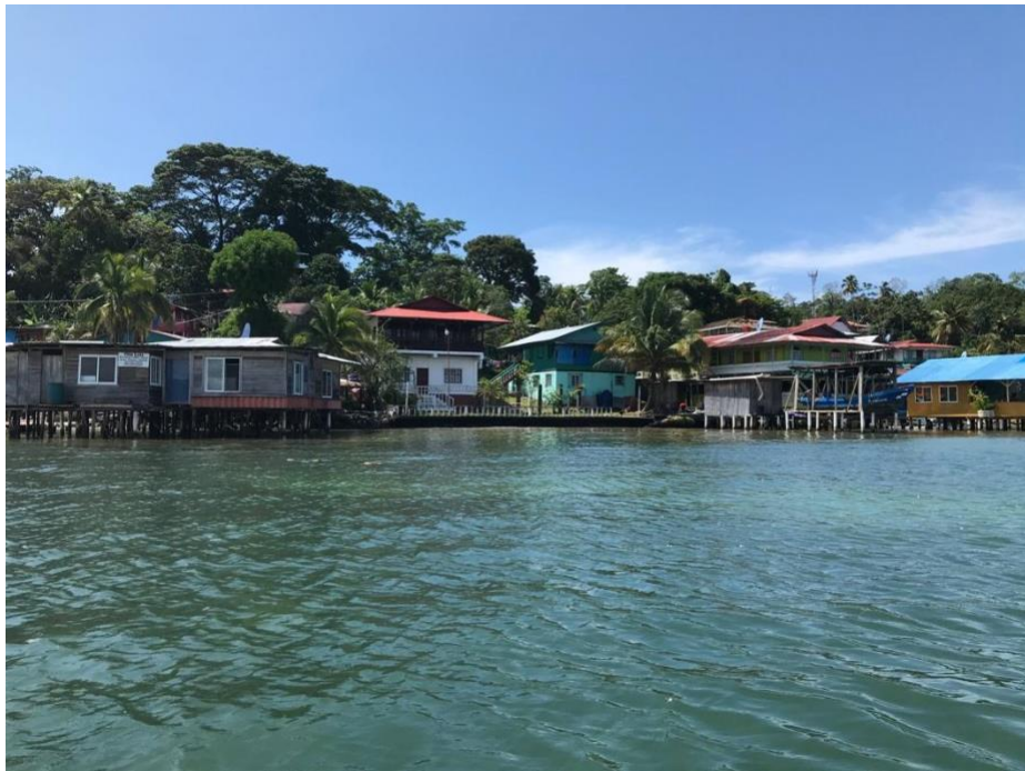
Figure 19 Sea view of Bastimentos