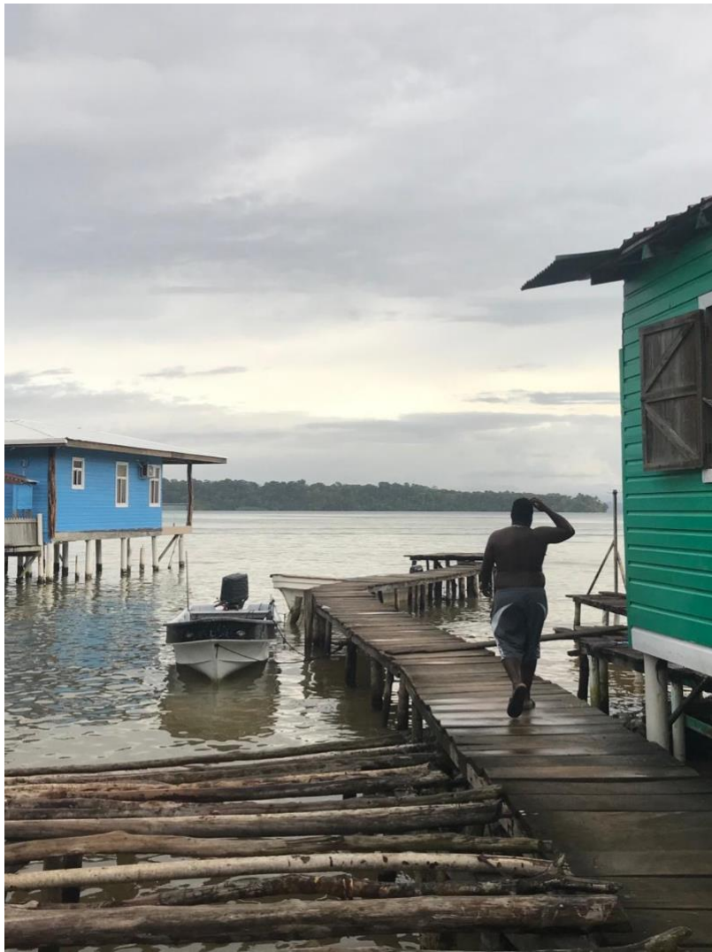
Figure 20 Man walking to his boat