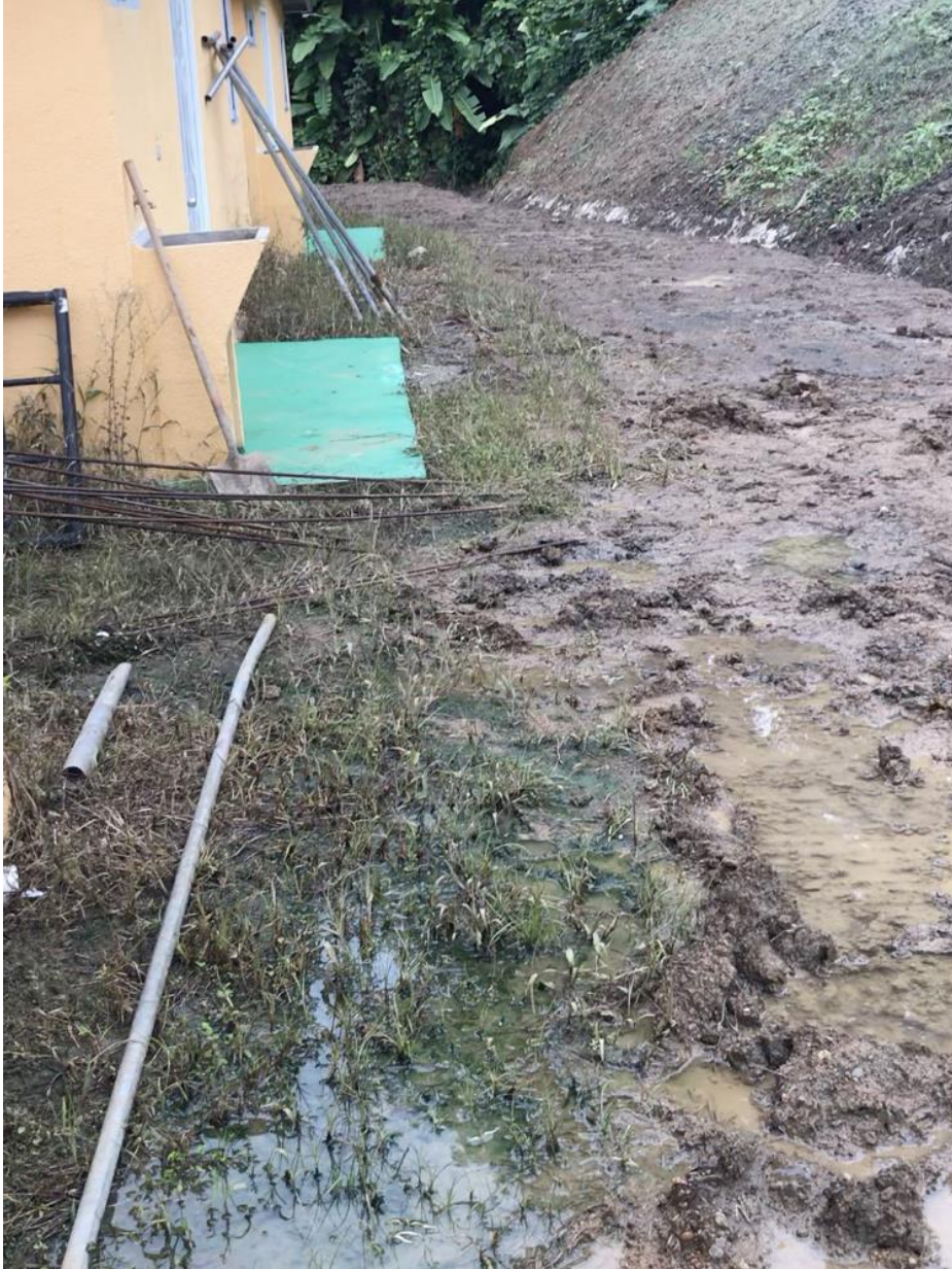
Figure 10 Image of water accumulating behind houses

One respondent reported that the project was declared to open in January of 2022, however the release date has been postponed due to the occurrence of a landslide which has destroyed two existing houses, yet the construction of additional housing persists.