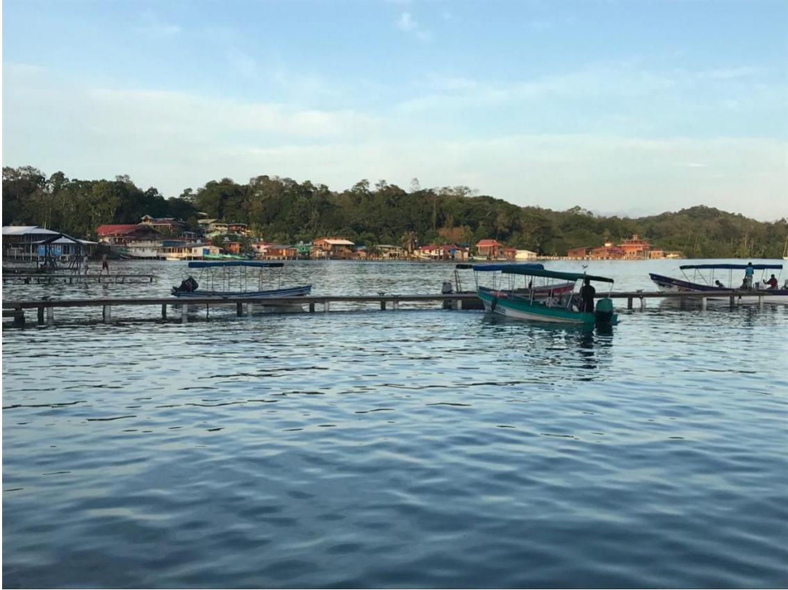
Figure 18 Tour boats on dock in town of Bastimentos