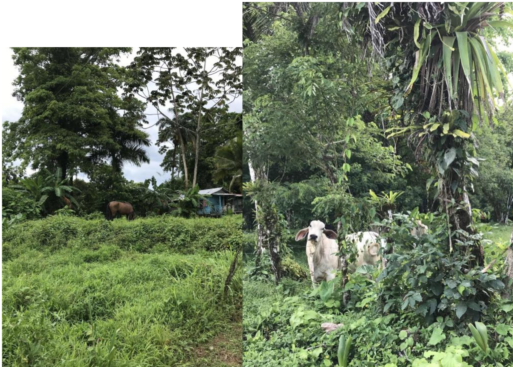
Figures 12 and 13 Horse and cow grazing in vegetated pastures

The point that the land was deemed unsuitable for uses other than a state determined relocation site has striking resemblance to the allotment of lands in South Africa in 1913. I argue that stripping residents of their knowledge systems, land stewardship, and sovereignty, while using deceitful tactics to promote complacency to the relocation- which I will describe later in this chapter- will promote their compliance to work low-wage jobs, and threaten local and traditional cultural survival and knowledge practices.