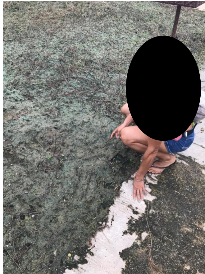
Figure 16 Participant demonstrating soil health