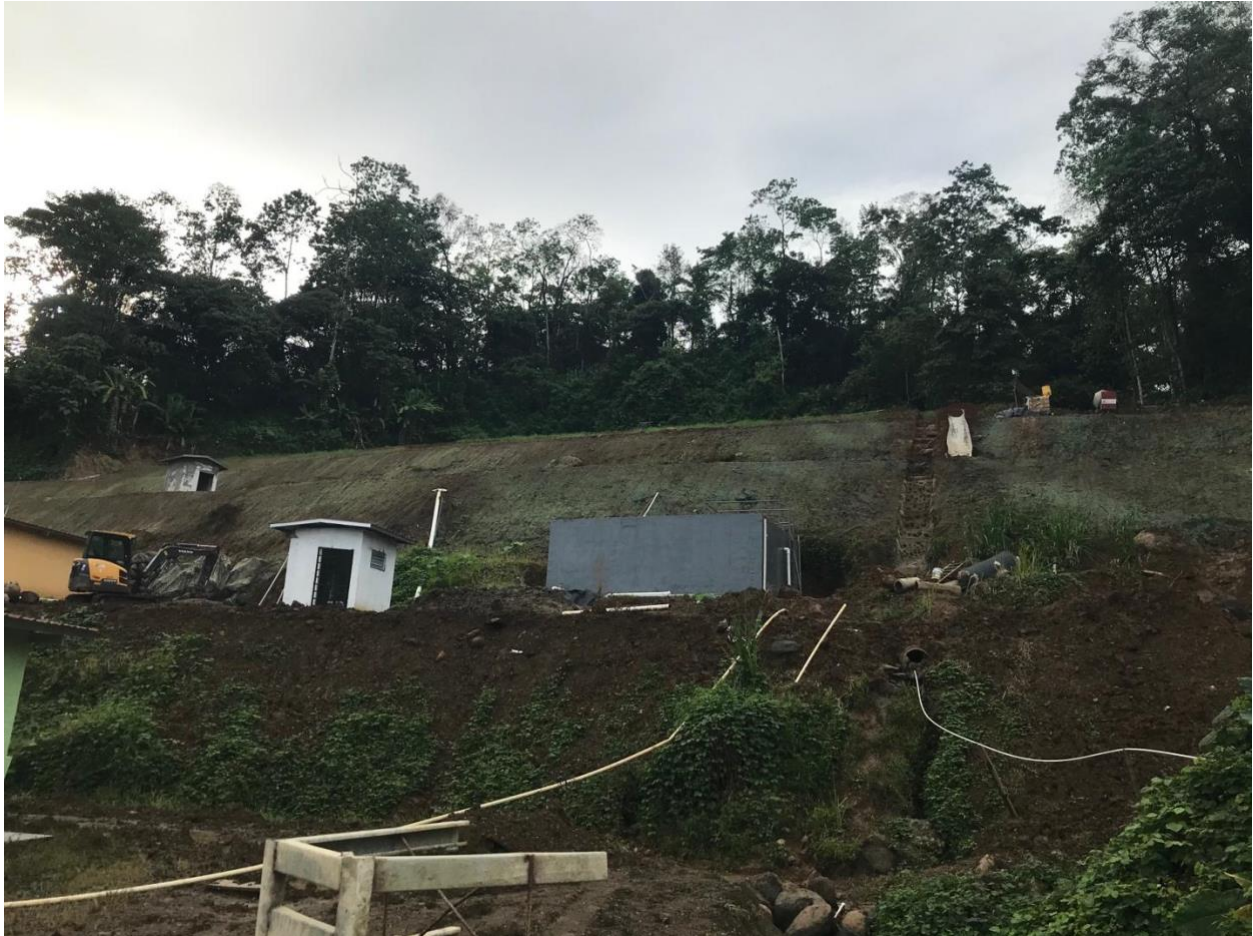
Figure 6 Image of hill on which EPTE is placed

throughout the slope of a hill, with layers of tiers on which rows of houses are placed (Figure 6 and 7). The site was densely forested area, however post development no trees remain on the premises.