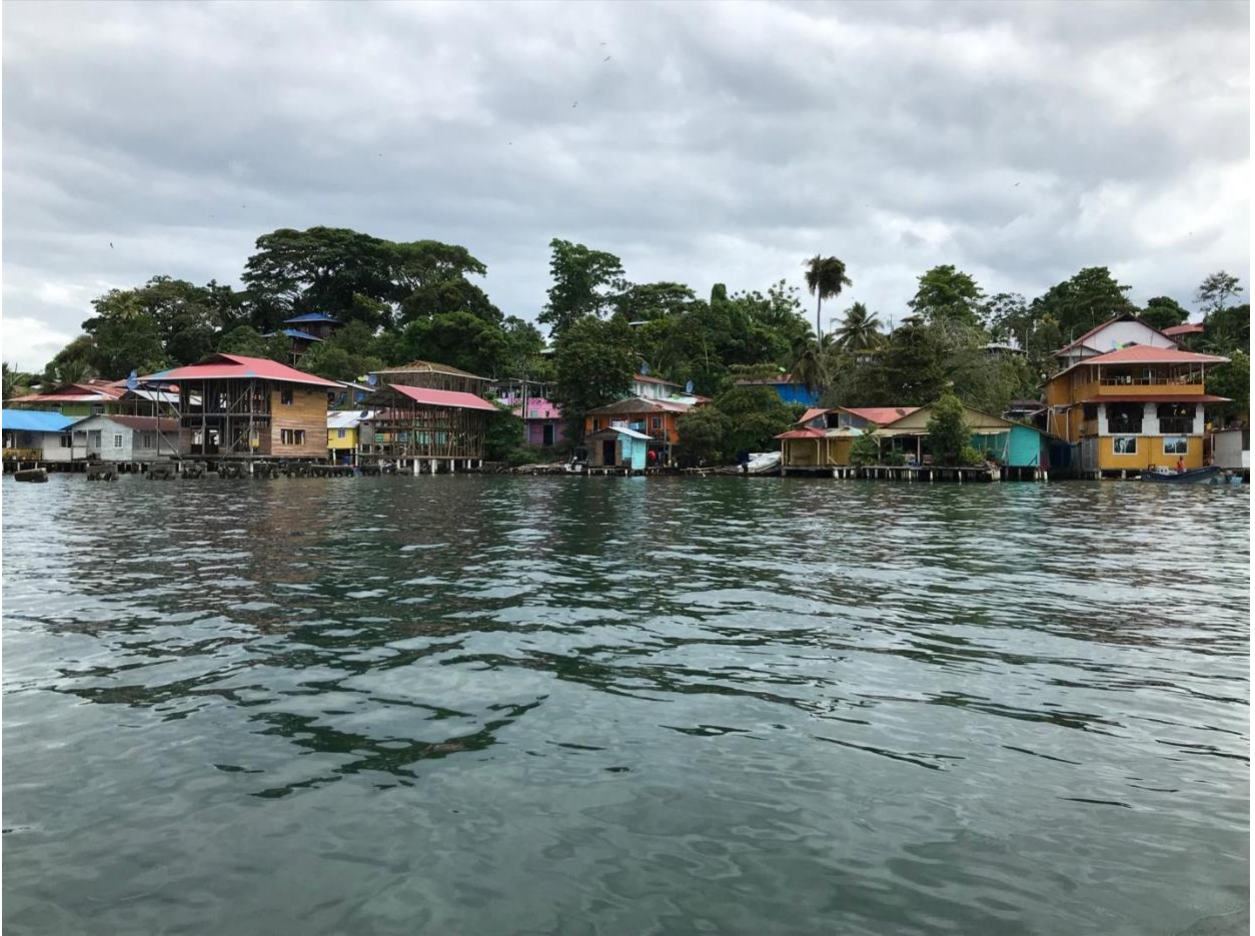
Figure 3 Seaside view of the town of Bastimentos