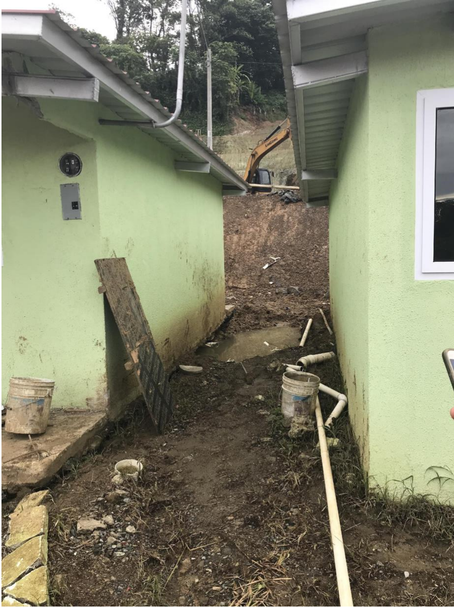
Figure 9 Image of water compiling at base of hill where houses are placed on top of wet soil without foundational support