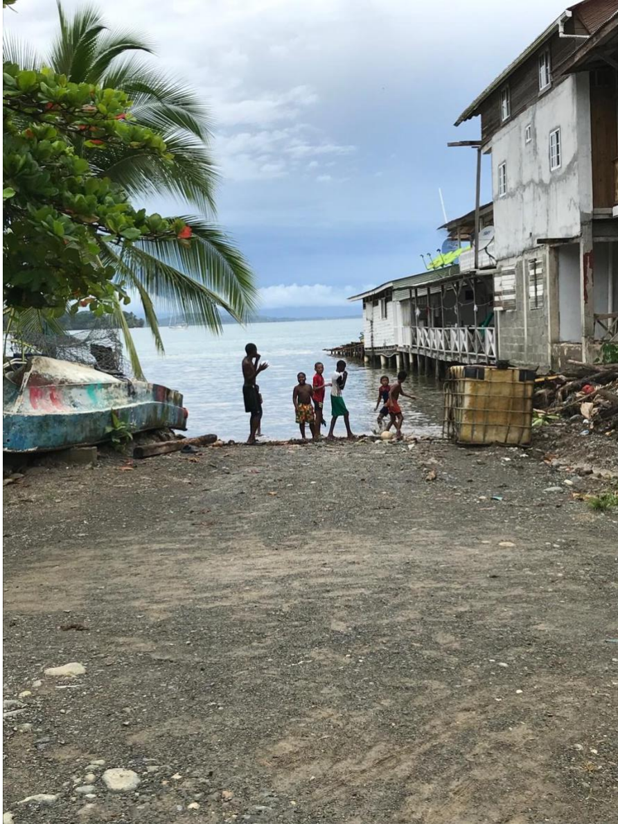
Figure 17 Children playing in the town of Bastimentos