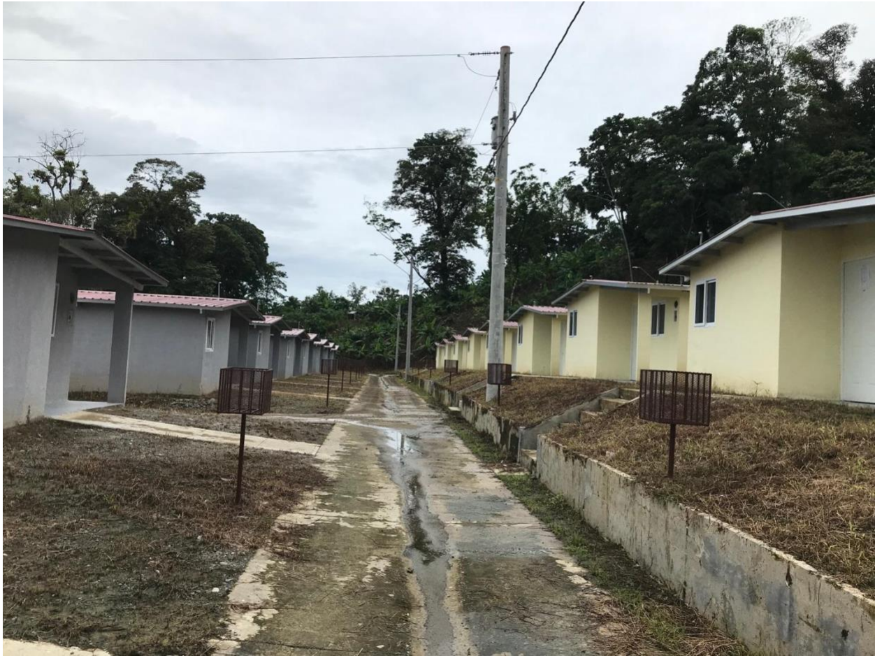
Figure 5 Street view photograph of EPTE

Alongside the pre-existing hazard of extreme and worsening heat waves in the area due to climatic changes, the addition of urban heat islands is likely to worsen the threat of increasing temperatures. Paving watershed areas with concrete produces “desert-like” hydrological and microclimatic conditions (Barnes et al. 2001). Replacing vegetated landscapes with impervious surfaces induces excess heat capture, and restricting tree coverage which provides shading and additive moisture to the environment further exacerbates heat affects (Coutes et al. 2012). Relative to vegetated areas, urban impervious surfaces have higher thermal conductivities and heat storage potential (Barnes et al. 2001; Christopherson 2001). As increasing temperatures already threaten the health of the community in the face of climate change, it is important to recognize the environmental