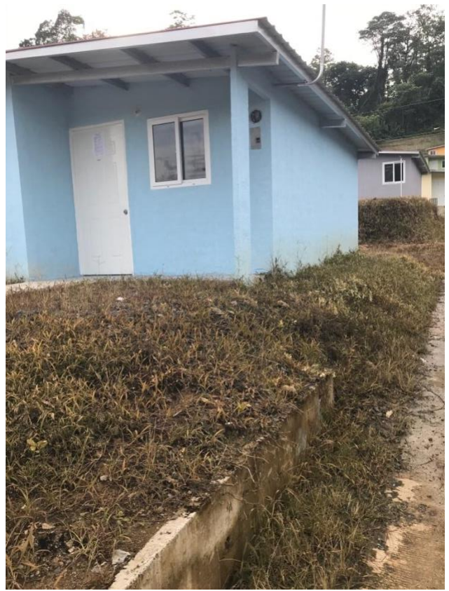
Figures 14 and 15 images of space and quality of land in EPTE