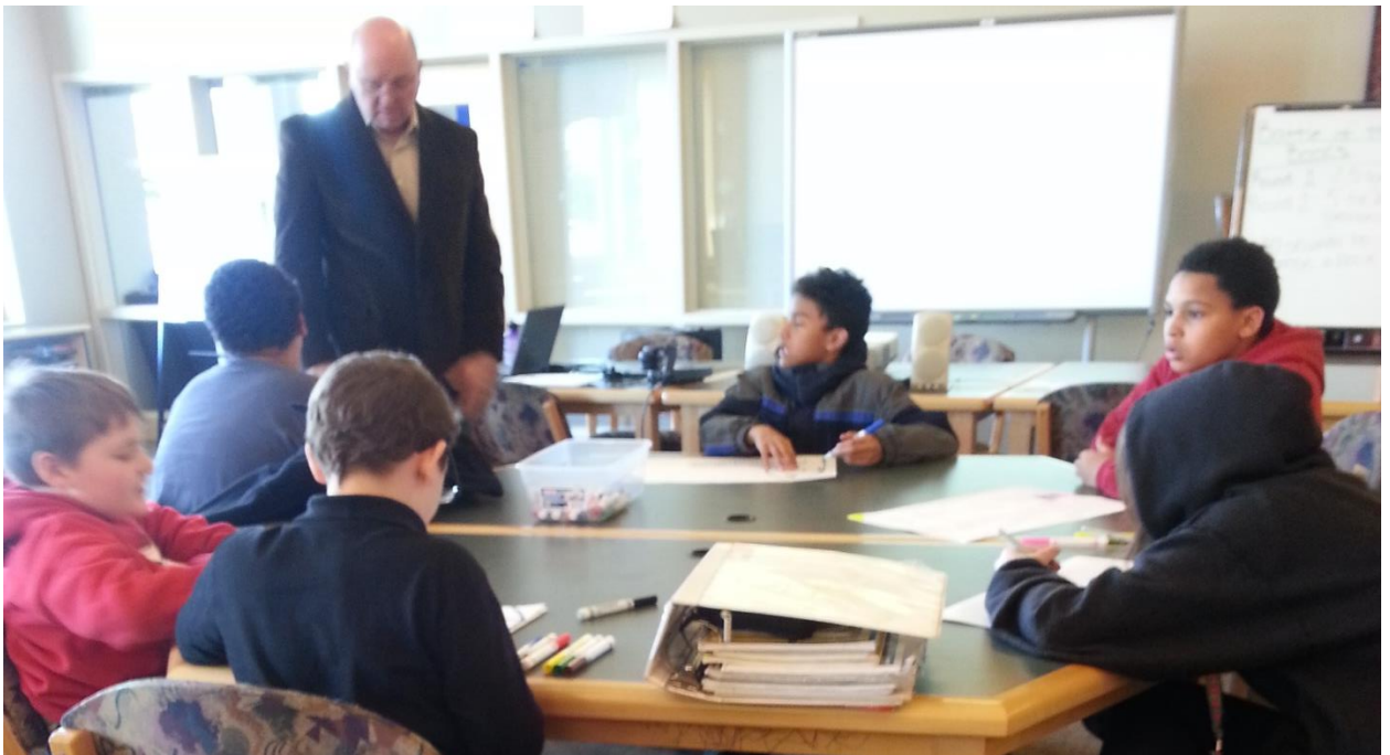
Figure 1: An after-school green design class

energy production, slide shows, and a box containing craft supplies, glue, colored markers, tape, drawing paper, and of course Lego building bricks. The Legos were used to attract the interest of the students and bring out their imagination to solve the problem of designing their own sustainable structure. The students listened to a fifteen minute lecture on the topic of the day, after which they split up in their groups and designed their green built, sustainable Lego houses.