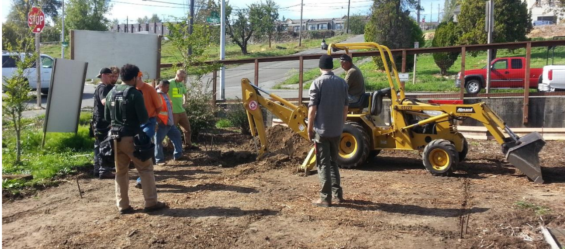
Figure 4: First day of construction at the SHED.

enthusiastic participation of students in the Construction and Sustainable Building Science programs at Clover Park Technical College.