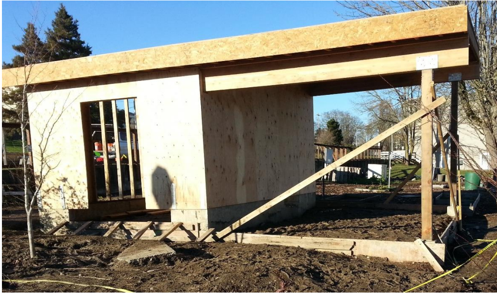
Figure 8: The East straw bale wall after plywood sheathing

on display, prospective builders can consider the technique, do the research, and make informed decisions about building their own homes.