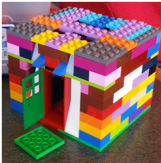
Figure 11: One of the first sustainable Lego houses

The students clearly picked up on the ideas of energy efficiency, carbon footprint, recycling, reusing products, renewable energies, implementing the ideas into their lives, and even what they might do for a job in the coming years. The use of Lego bricks was a very big hit. Some of the models were wildly creative (Figure 11), but the exercise sparked their imaginations, and also helped to solidify the concepts of sustainability.