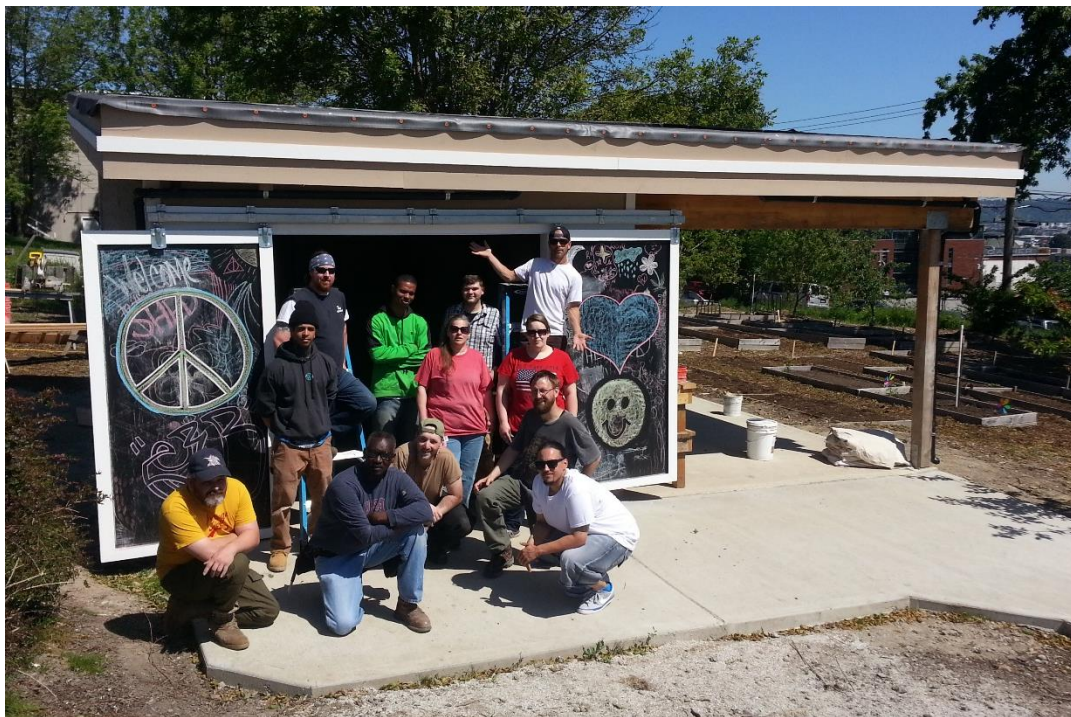
Figure 10: The student builders showing their pride of accomplishment

As I went by a pitch-pine wood the other day, I saw a few little ones springing up in a pasture from seeds which had been blown from the wood... In a few years, if not disturbed, these seedlings will alter the face of Nature here. H.D. Thoreau Faith in a Seed