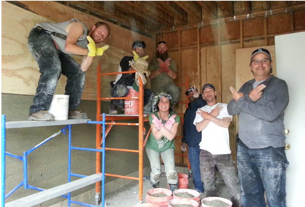
Figure 12: The hemp crew displaying hemp love at the end of Earth Day event

permitted in Washington State. It was an amazing accomplishment and a stellar display of the UW Tacoma commitment to interdisciplinary collaboration (Figure 12).