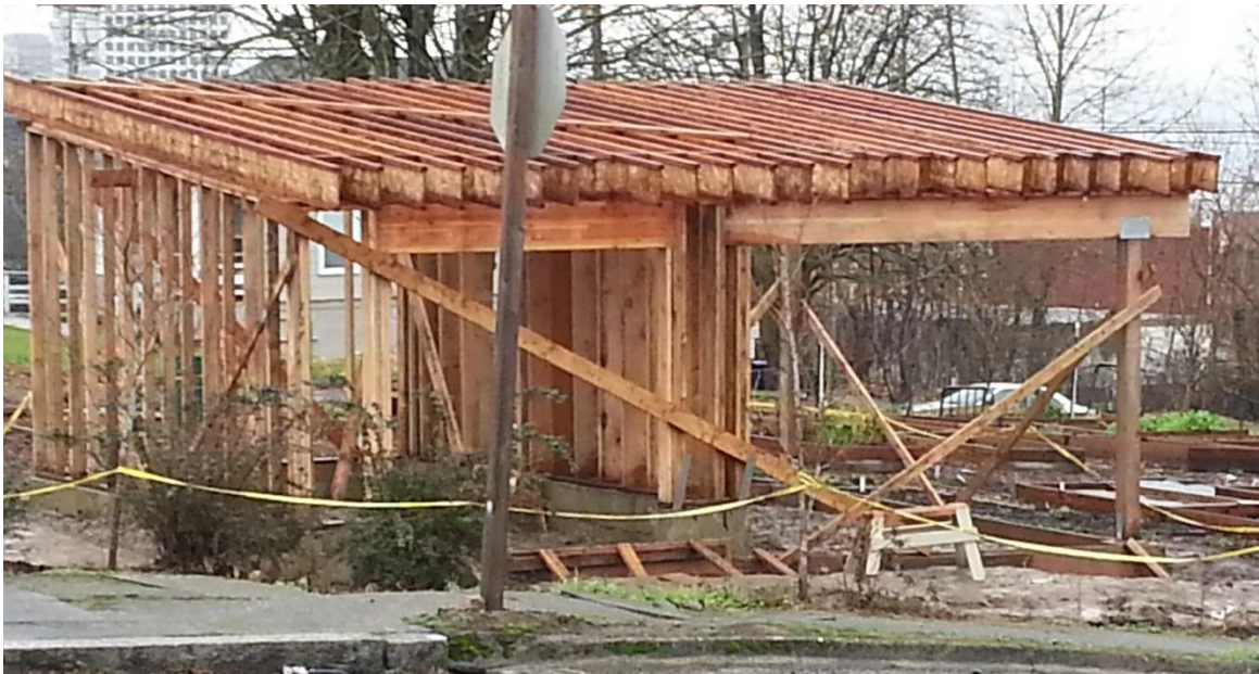
Figure 7: The primary wood framing of the SHED