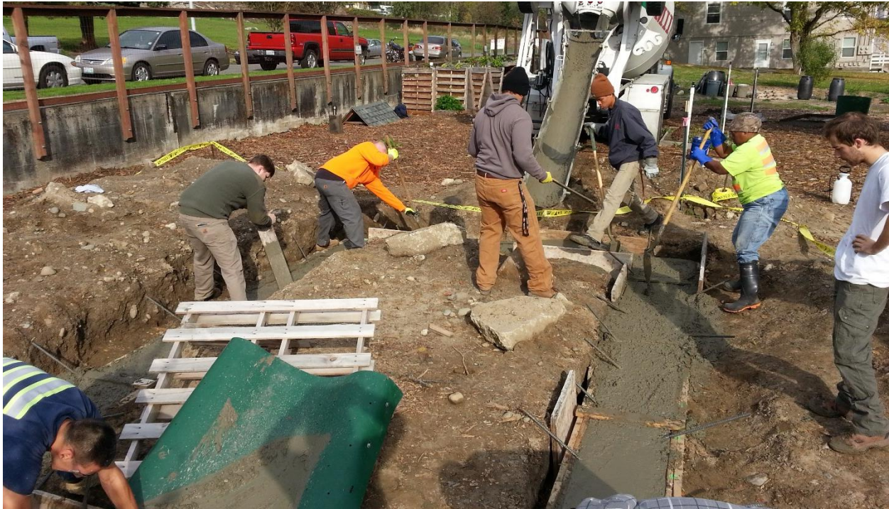
Figure 6: SHED footing being placed by CPTC students