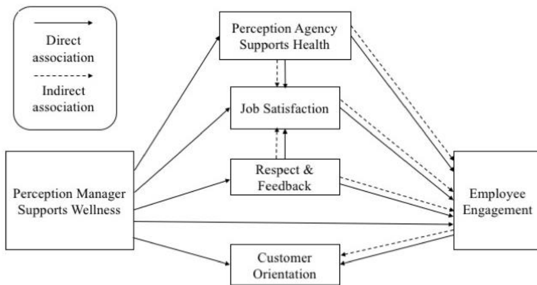
Figure 1. Conceptual model depicting the hypothesized pathways. The dashed lines represent the indirect associations from managers' support for wellness to employees' engagement at work.

Note: Direct associations are when a single-head arrow connects one variable to another variable. Indirect associations are when the path connects one variable to another variable which connects to a third variable.