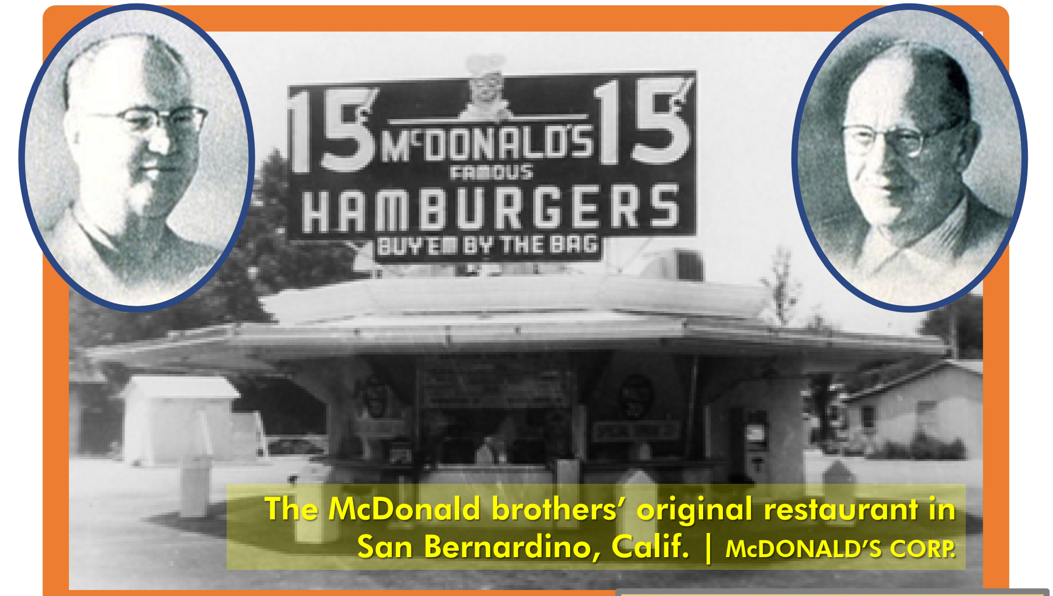
The McDonald brothers' original restaurant in San Bernardino, Calif.

According to the company, Kroc's first restaurant is considered to be the "first" McDonald's, and Kroc the founder.