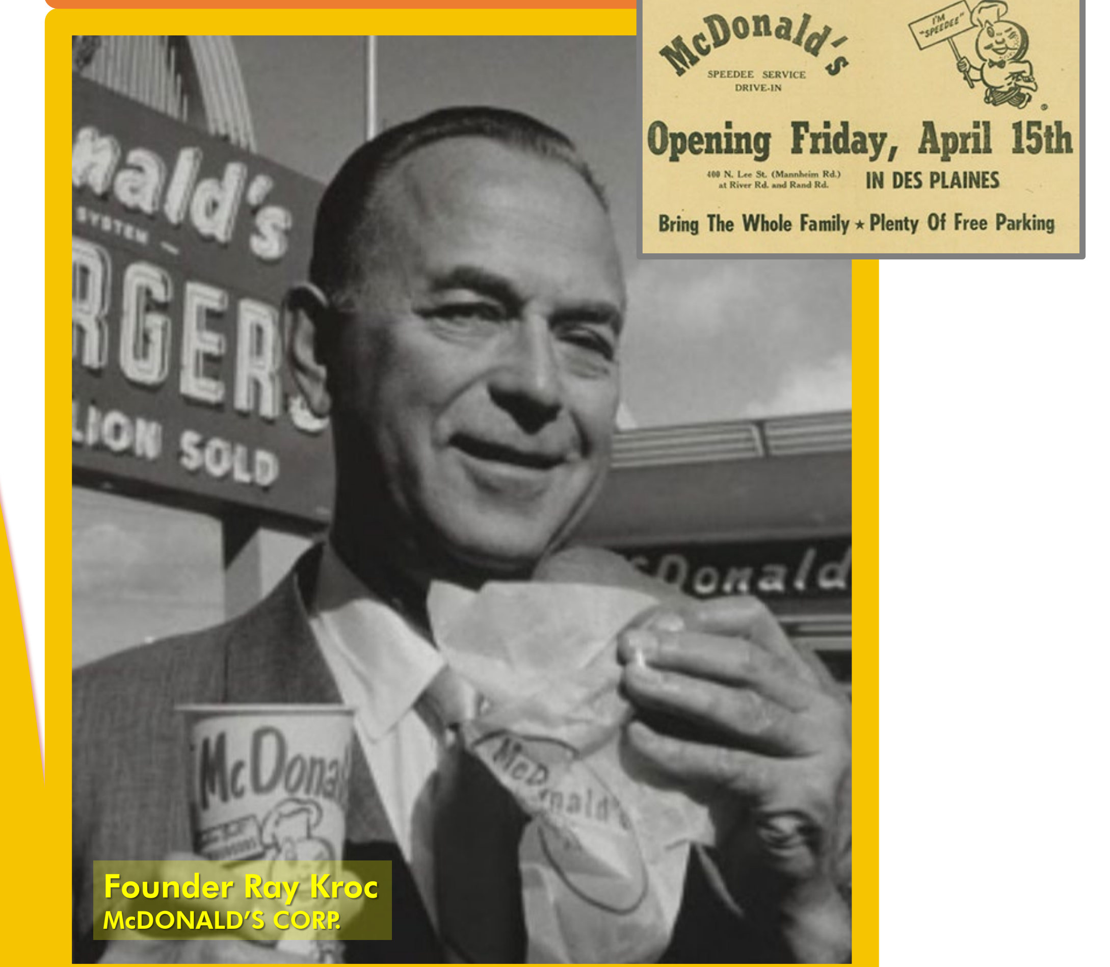
Founder Ray Kroc MCDONALD'S CORP.