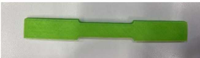
Figure 5. A warped green PLA dog bone that warped severely without a heated bed. The length and width (shown) are slightly angled, but the depth (not shown) warped to be about 30% thinner than designed.

Another common failure sometimes caused by unrefined printing parameters is part warping during a print. More common in high temperature materials like ABS, part warping can be caused by many print parameters [5]. Warping is usually caused by rapid temperature change, which will cause the part's adhesion to the build plate to fail allowing the part to warp further. A heated build plate can mitigate this temperature difference and maintain the shape of the part by making it less likely for the part to peel off the build plate. This can also be done by printing a bed adhesion structure such as a brim, raft, or skirt depending on your slicer. An example of a warped part can be seen in Figure 5 .