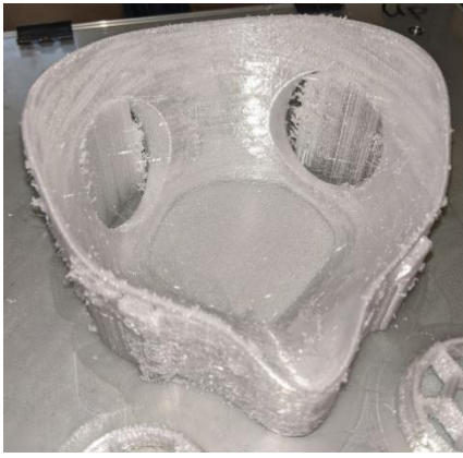
Figure 4. A part printed from clear PETG at an unnecessarily high temperature causing surface defects such as stringing and burrs.

Low print temperatures will not allow the material to melt as effectively. It will lower the flow rate of the material through the extrusion nozzle and possibly cause blockages, clogs, and jams. This almost invariably needs to be fixed by taking the hot end assembly apart and removing excess material by hand. High print temperatures are not favorable either. As seen in Figure 4 , there are a high number of surface defects in the form of stringing and burrs. While these can be removed during post-processing, it can be avoided by changing printing parameters. Every 3D printer will have a different orientation of heating element with respect to geometry and distance to the melted material and the thermistor. Every printer will have an ideal print temperature where material flows as intended but hardens soon after leaving the nozzle. This can also be achieved through part cooling. Having a small fan blow on the material as it prints cuts down on these surface defects as well.