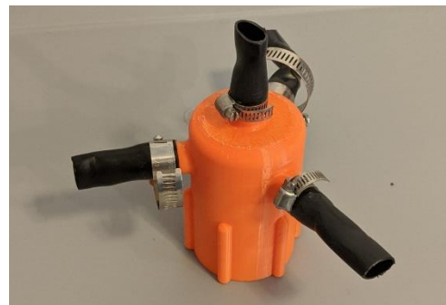
Figure 3. 3D printed from orange PLA, this hose adapter failed in multiple places, resulting in spouts of water coming out of small cracks created by internal water pressure.

Printing parameters in this context are being defined as the aspects of the additive manufacturing process that can be directly controlled in either the slicer settings or can be tuned during the print. They usually vary between various materials, parameters usually including print temperature, build plate temperature, print speed, and part cooling. Various failures can arise from materials being printed with unfavorable print parameters.