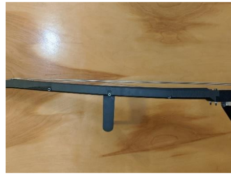
Figure 2. 3D printed from a nylon-6 and carbon fiber chop composite; this cello has noticeable bending takes place under the tension of the strings

One case where the choice in material caused inadequacies in the final product is shown in Figure 2 . In the hopes of taking advantage of the acoustic properties of carbon fiber [4], the nylon-6 and carbon fiber chop composite by Markforged was used to create a cello. Unfortunately, the nylon substrate of the composite was too pliable, leading to