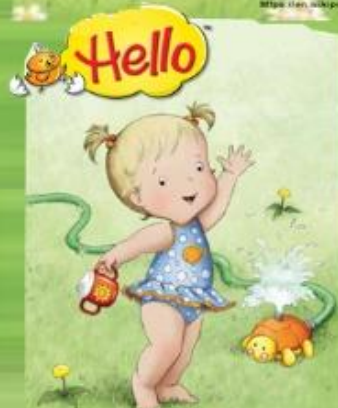
Figure 2. Undated cover of Highlights Hello Magazine. (Digital image).