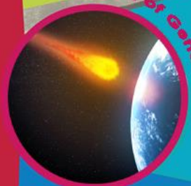
Figure 4. Meteor hurtling towards earth.

"Gender is briefly described as the meanings, practices, and relations of femininity and masculinity that people create as they go about their daily lives in different social settings" (Spade & Valentine, 2011, p. xiii).