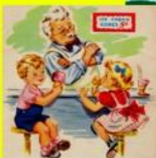
Figure 3. Adorable kids at the table foundation (Online image). Retrieved from https://www.zaccc.com/adorable-kids-at-table

Featured Story: Gender, Thirty-one Flavors and More p.24