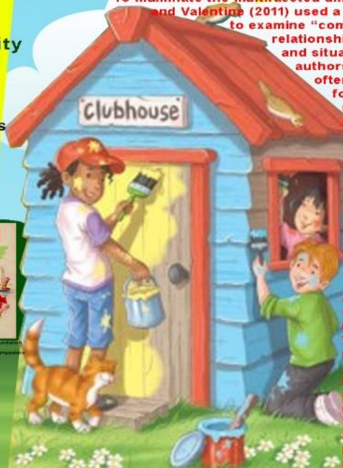
Figure 1. May 2013 cover of Highlights magazine. (Digital image).

To illuminate the multifaceted dimensions of gender, Spade and Valentine (2011) used a “metaphorical kaleidoscope” to examine “complex patterns of identity and relationships for people across groups and situations” (pp. 3, 55). What the authors found was that gender is often defined by what it is not, for example, “it is not sex,” nor is it “an essential identity” (Spade & Valentine, 2011, p. 6). Gender, therefore, stands apart from biological determinism and its rigid and essentializing classification processes. These processes often center on binary opposition and the conceptualization of gender is no exception; for example, Lucal (1999) stated “gender is constructed around heterosexuality in the context of patriarchy” (p. 30). Gender discourse challenges the boundaries created by Western culture’s dominant narrative that there are “two and only two sexes, male and female, and two and only two genders, feminine and masculine (Bem, 1993; Lucal, 2008; Wharton, 2005, as cited in Spade & Valentine, 2011, p.3). From a sociological perspective, scholars view gender as a social construct that “derives [its] significance through human interaction” (Williams, 2006, p. 67; see also Lucal, 1999). In this view gender is seen as multidimensional and fluid as well as “negotiable and dynamic” (Spade & Valentine, 2011, p. 6).