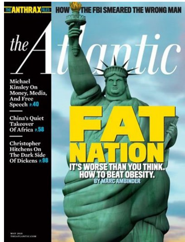
Figure 4.1. The Atlantic magazine’s May 2010 cover declares the United States a ‘Fat Nation’ and features a disfigured Statue of Liberty, reflecting and promoting obesity’s status as what Goffman called a ‘tribal stigma’ ascribed to the country at large. 483

Amy Erdman Farrell’s archival study of the origins of the contemporary meanings of fatness in American culture demonstrates that the processes of attributing negative valences to fatness, alongside those of devaluing blackness and femininity, have been central to the cultural development of what constitutes a proper American body. The development of fat stigma ‘is intricately related to gender as well as racial hierarchies, in particular the historical development of ‘whiteness.’ Farrell shows how medical, political, academic, and popular cultural discourses linked weight to the privileges of citizenship over the late nineteenth and twentieth centuries, establishing ‘body size as one important