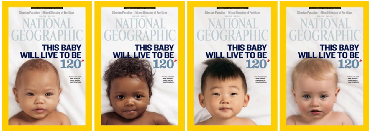
Figure 1.1. National Geographic's multiple May 2013 cover versions. 41

The May 2013 issue of National Geographic magazine carried the auspicious headline ‘This Baby Will Live To Be 120’ and an equally sanguine subheading: ‘It’s not all hype. New science could lead to very long lives.’ 42 The feature article follows the quest of geneticists to uncover genetic clues to longevity using ‘powerful genomic technologies.’ 43 Borrowing from the playbook of fashion magazines struggling to captivate an increasingly aloof print audience by producing multiple cover versions of their monthly editions, National Geographic published four variants of its May cover, all with identical layouts but each featuring a unique infant cover model. Each baby wears a cherubic expression and a birthday suit; what distinguishes these potential centenarians is their racial encoding. The first cover version features a fair-skinned girl with hazel eyes and pale blond hair, the