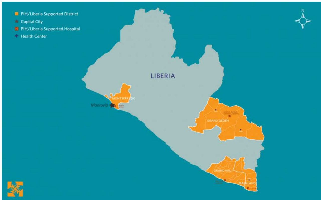
Figure 1: Map of Partners In Health’s activities in Liberia. This study took place in Maryland County.