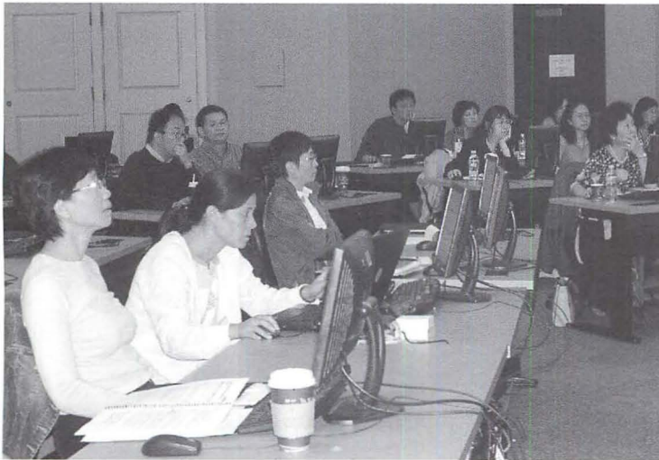
A morning course in the Suzzallo Library Instruction Room 102A.

The only degree program ever offered on a North American campus was the Joint Program in Far Eastern Librarianship offered at the University of Chicago,