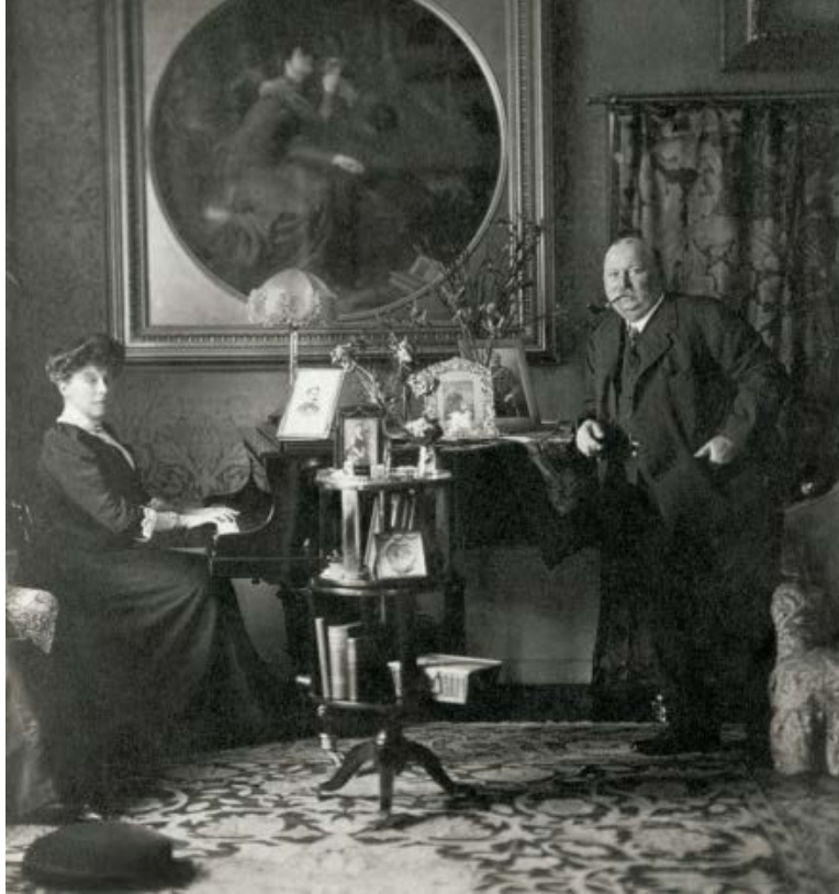
Fig. 1. William Knox D'Arcy. 45