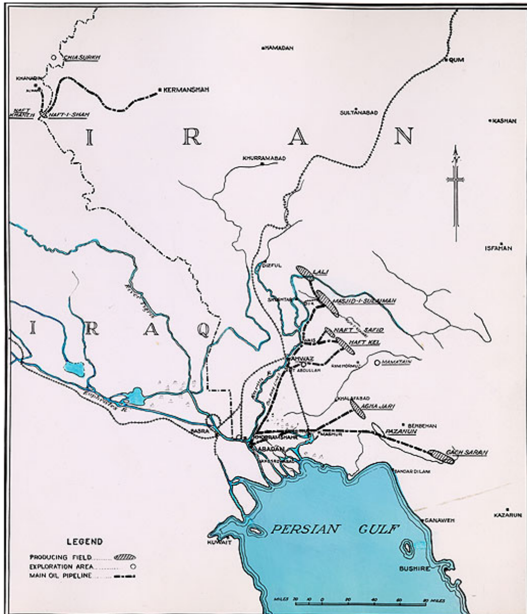
Fig. 7. Map of Oil in Persia. 154