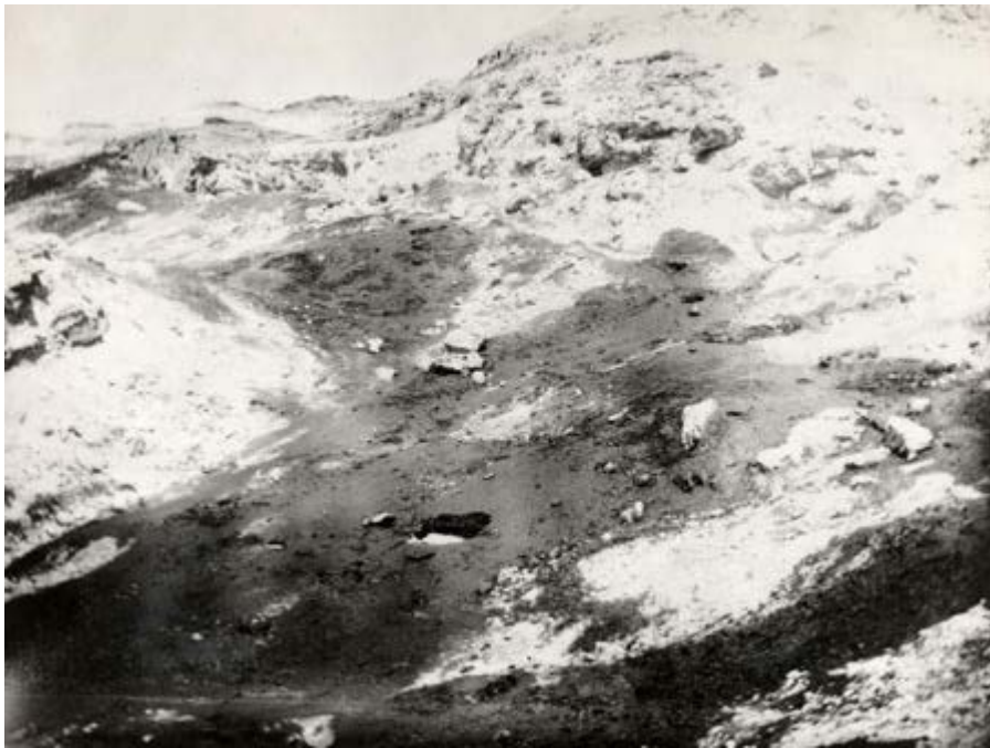
Fig. 2. Oil Springs along the Mendali Ridge, 1902. 50