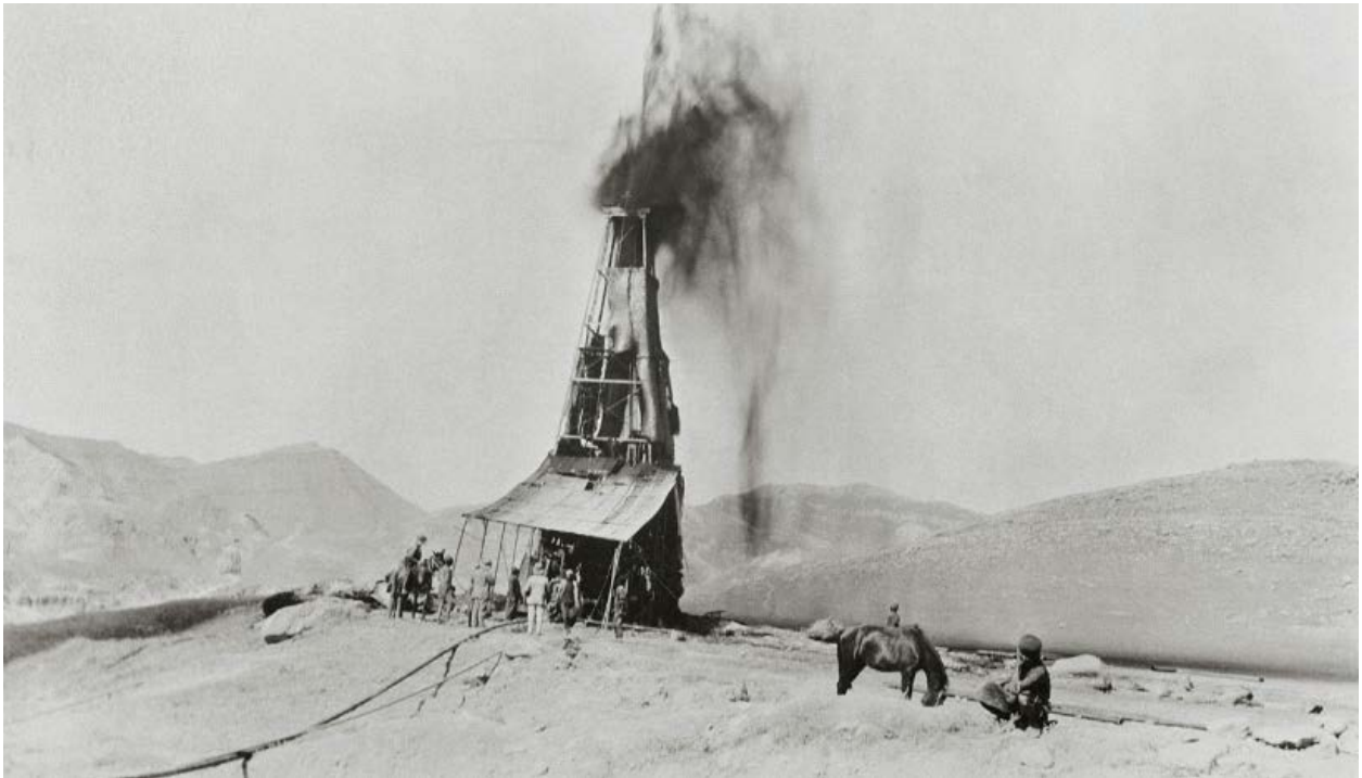
Fig. 6. The First Oil Well at Masjid-i Suleiman. 133

Karun River, and provided assurances to the British, while Khazal sought to maintain amenable relations with the Bakhtiari. Britain managed to strike oil in Masjid-i Suleiman in 1908. As a result, Shustar and Dezful would be the battleground between the Bakhtiari and Khazal, and the Arab tribes of Khuzestan. 132