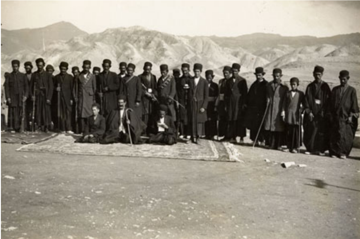
Fig. 5. The Bakhtiyari guard, with head guard in the center. 83

The agreement also enforced guards on the roads and in towers, in which the Bakhtiyari khans would provide. Within a few months, there was disagreement among both the Bakhtiyari and the concessionary forces.