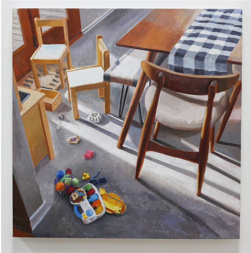
Aftermath , Oil on Linen, 2022

"What do you express when you're making your paintings? What you express is unconscious. It is not something you planned. I think that plans are less interesting than the aura that comes off your painting."