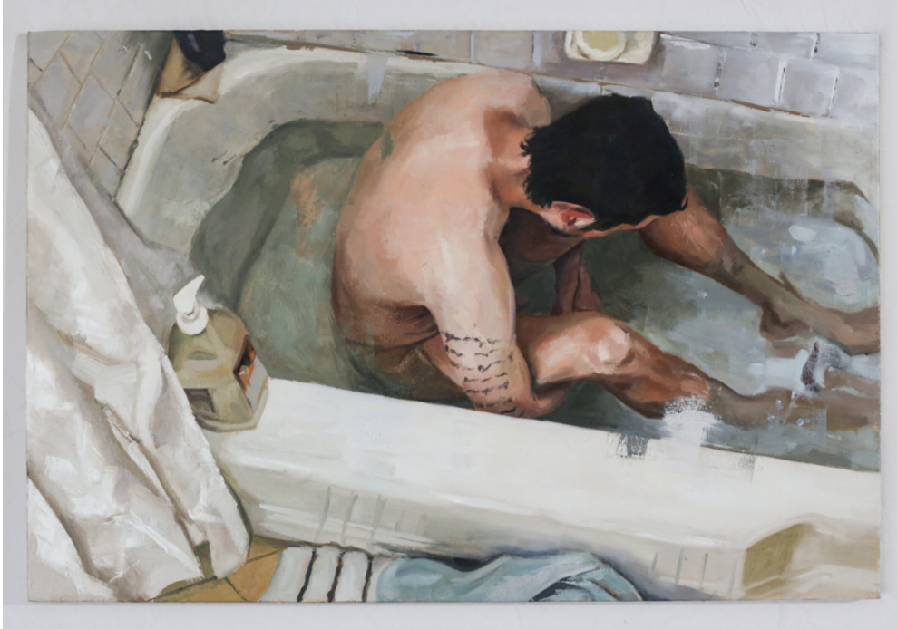
Solace , Oil on Canvas, 2020