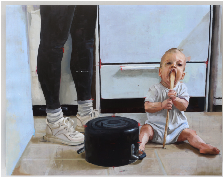
Quarantined, Day 24 , Oil on Linen, 2020