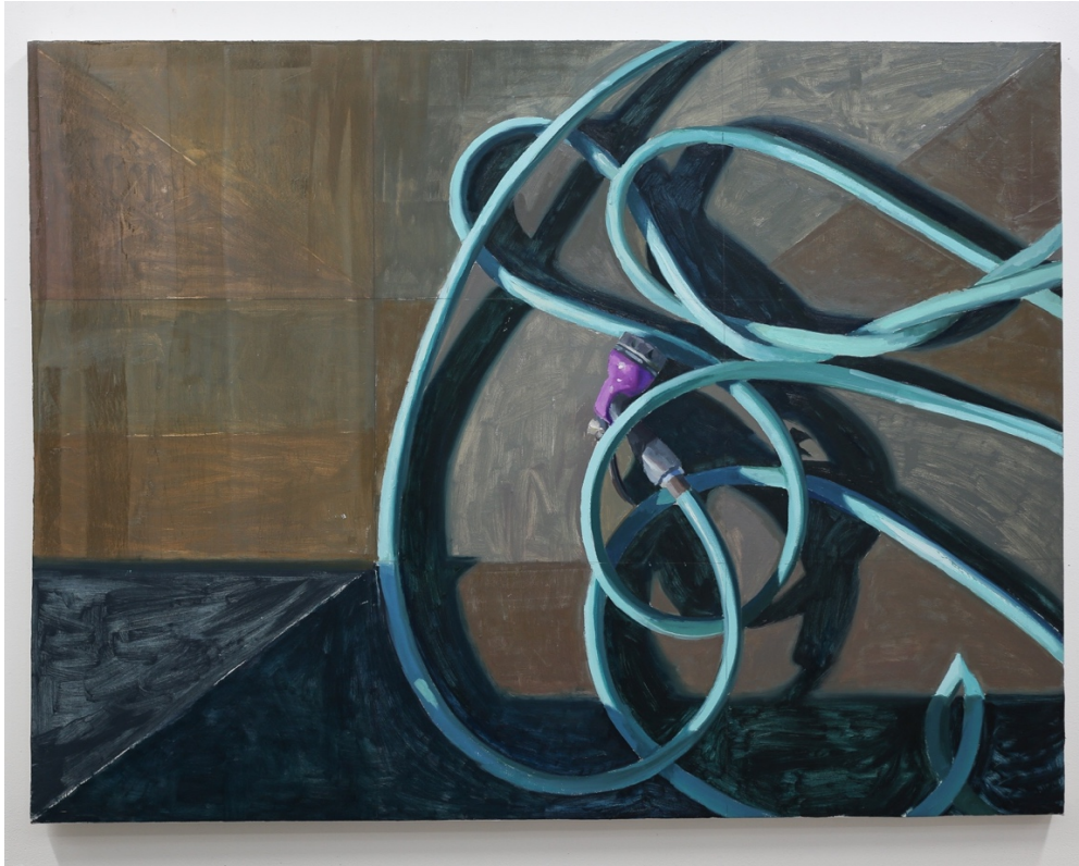
8-Hour Workday (1), Oil on Canvas, 2022