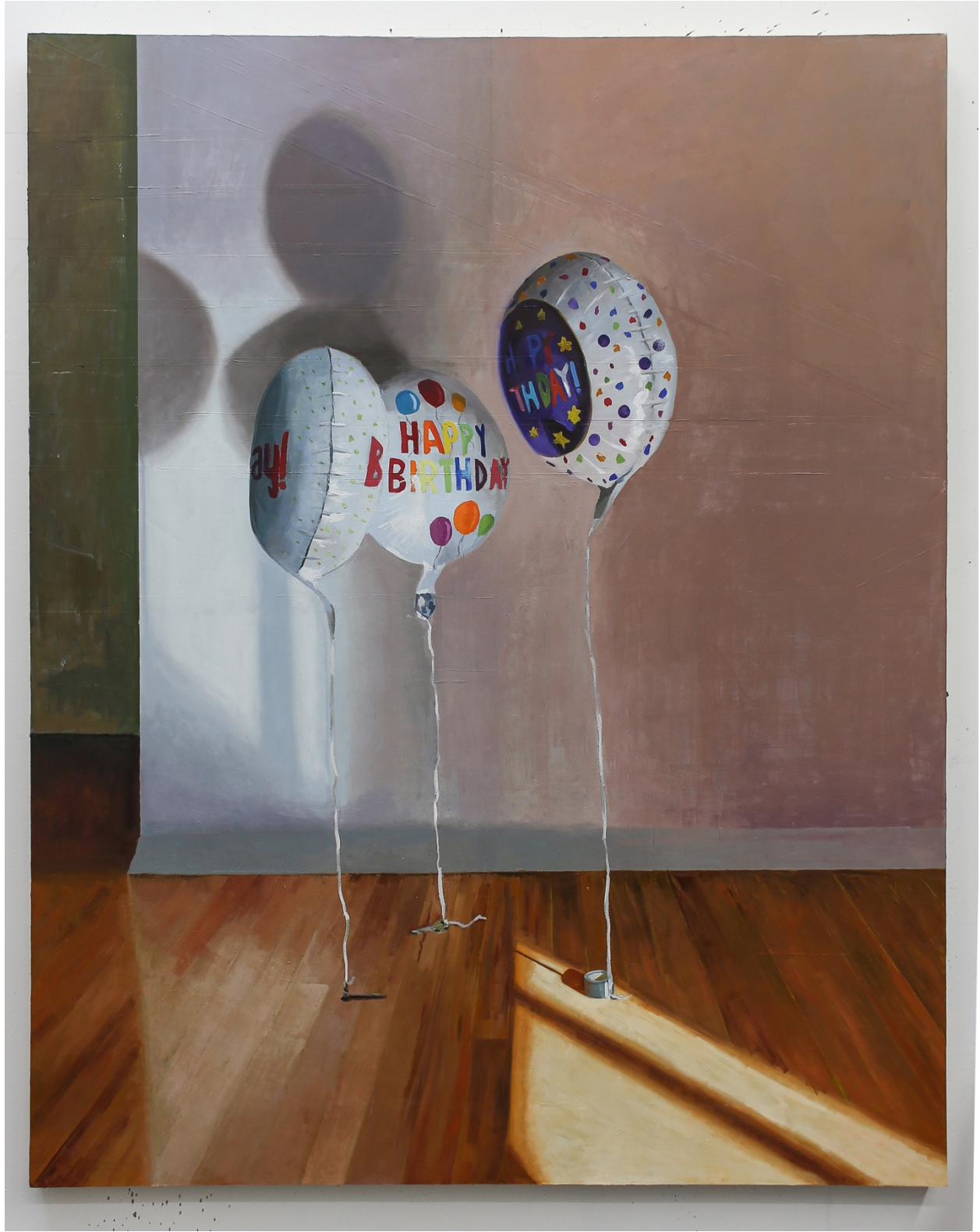
Balloon Gang , Oil on Canvas, 2022