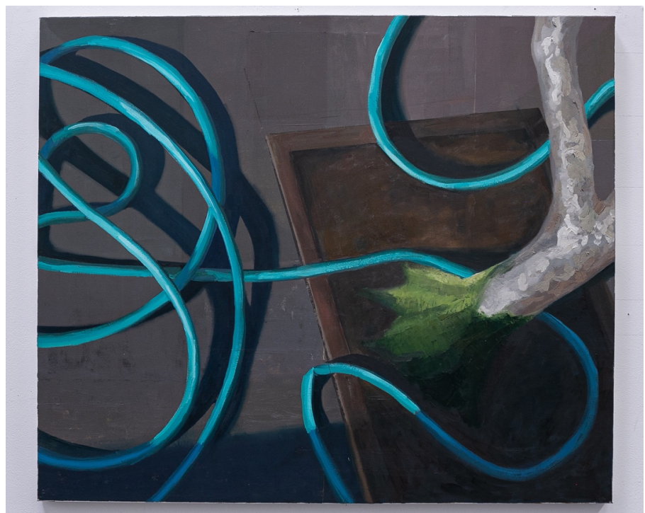
8-Hour Workday (3), Oil on Canvas, 2022