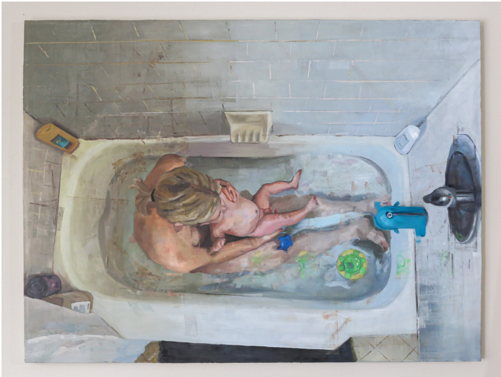
Solace (No.2) , Oil on Canvas, 2020