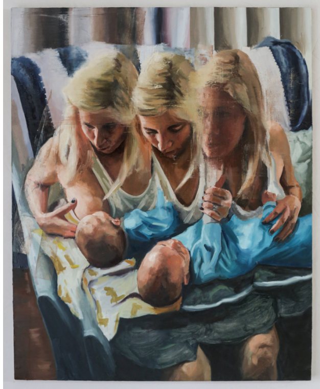
Morning Feed , Oil on Canvas, 2019