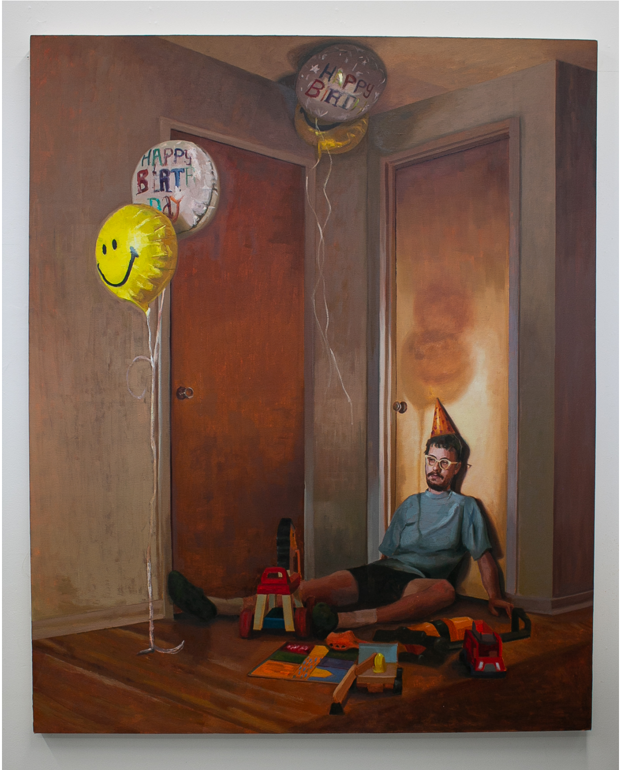
All in a Day's Work , Oil on Canvas, 2022