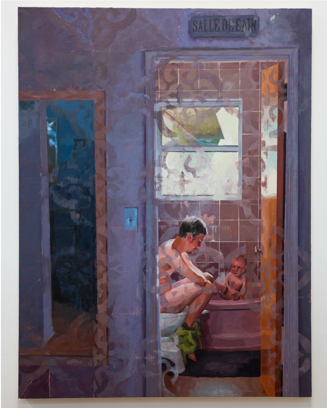
Salle De Bain , Oil on Panel, 2021