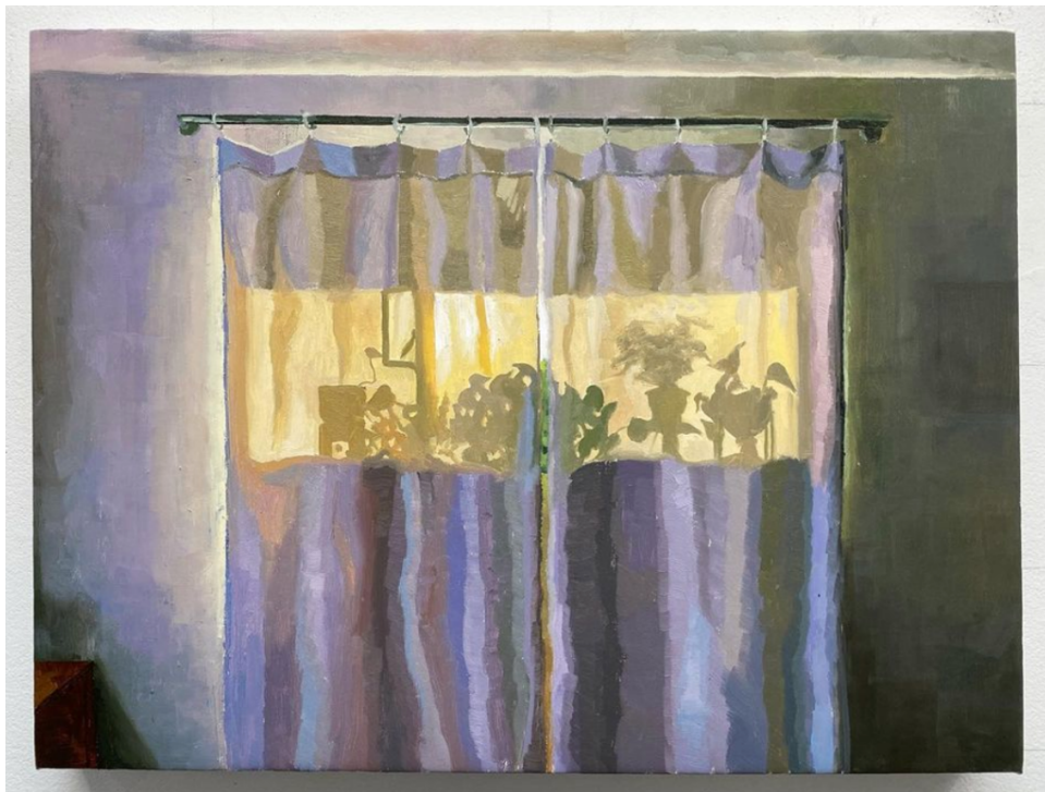
Censored, Oil on Linen, 2021