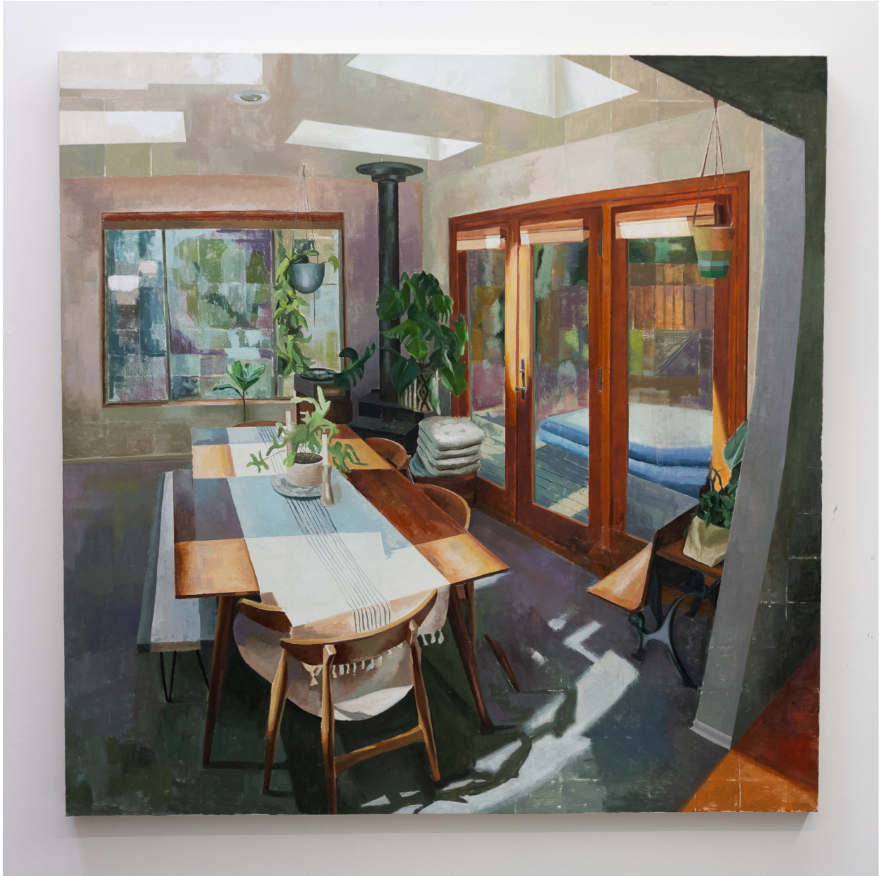
Vacant Dining Room , Oil on Canvas, 2021-22