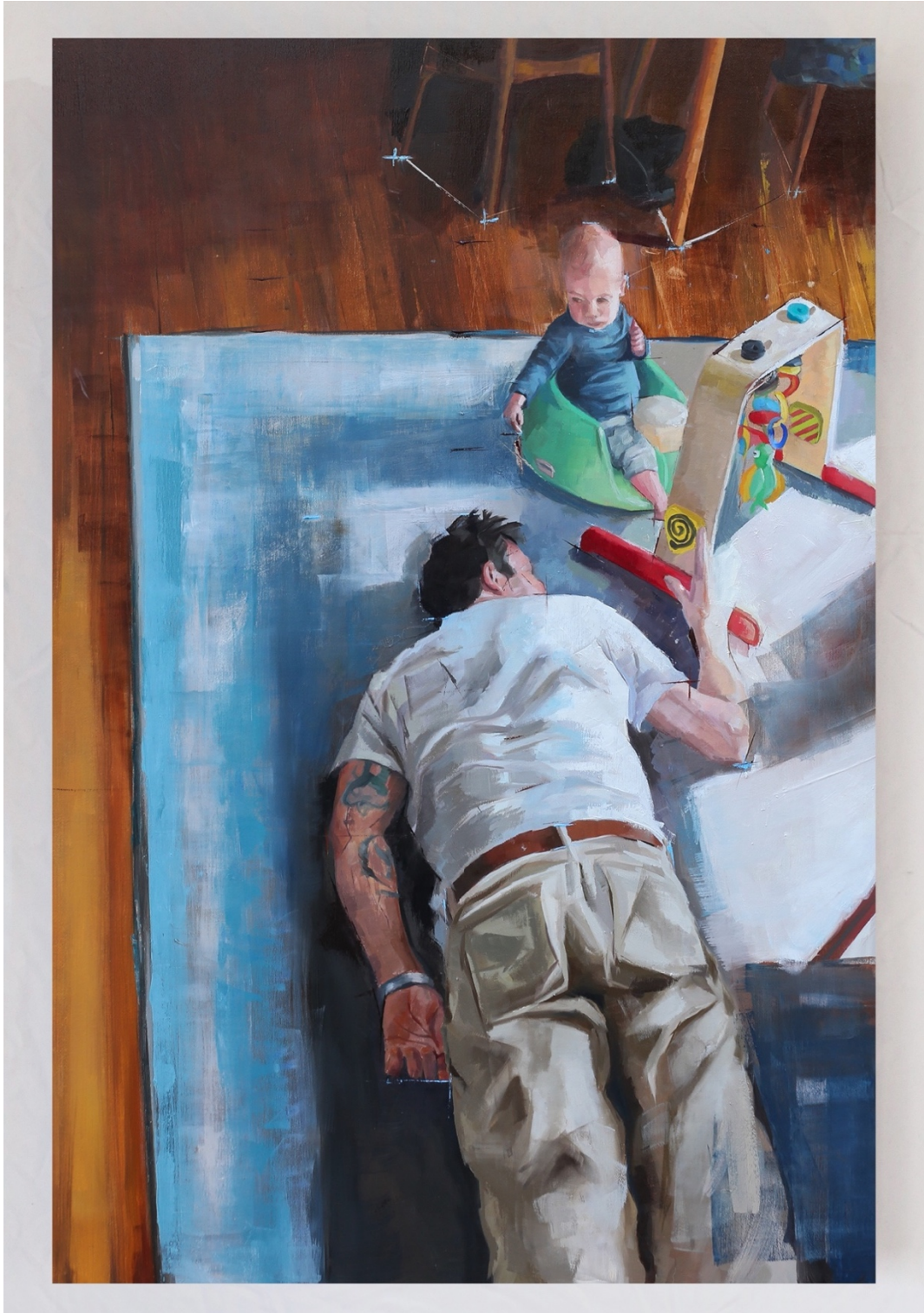
Quarantine, Day 34, Oil on Linen, 2020