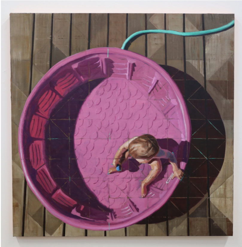
$7 Pool , Oil on Linen, 2020