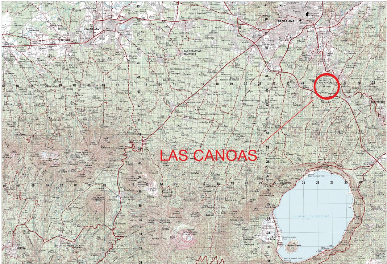
Figure 1 241