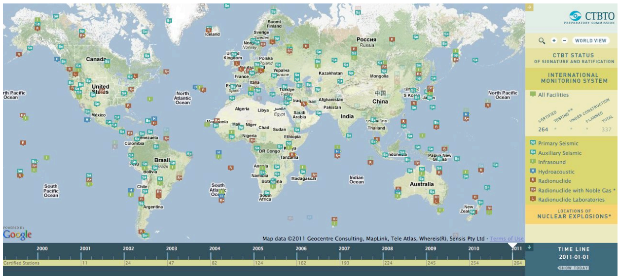
Certified facilities 2011 (above)

The second main issue that prevented ratification in 1999 was the Senate's concern over Stockpile Stewardship in the United States. Stockpile Stewardship is a term referring to the