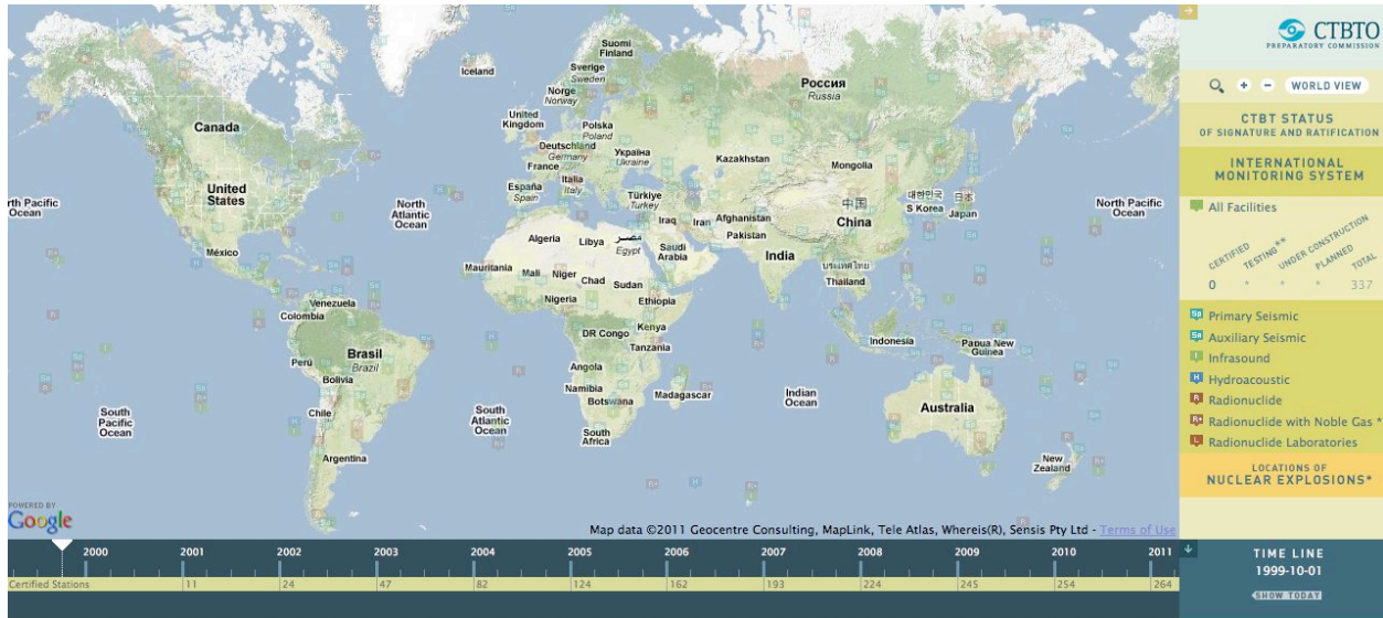
Certified facilities 1999 (above)

especially when the verification regime is already working and ready to detect nuclear explosions around the world.