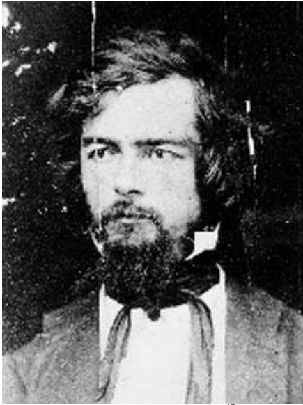
Isaac Ingalls Stevens, circa 1855. 47