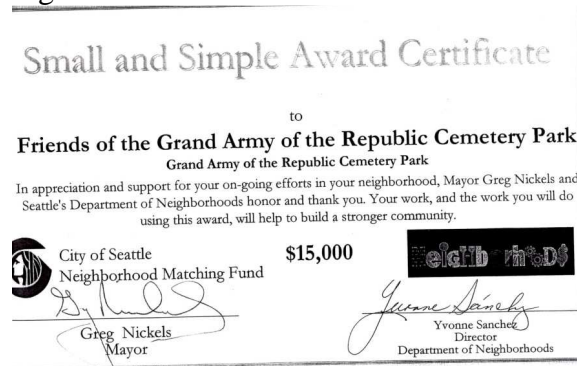
An image of one of the Neighborhood Grants received by the FGAR.