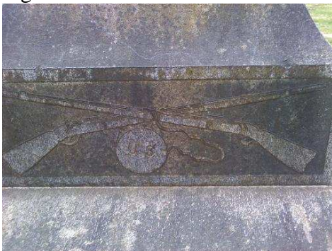
Crossed guns represent Infantry.