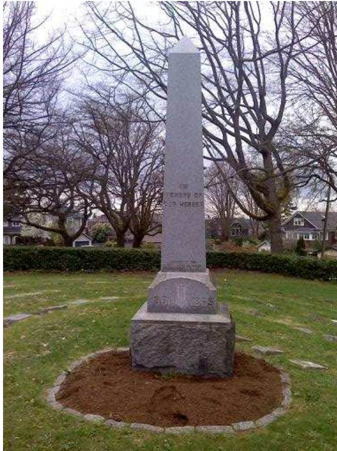
Photography by author, April 10, 2012.

Recognizing Seattle’s Involvement in the Civil War and Honoring the city’s Civil War Cemetery