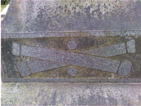
Crossed cannons represent Artillery.