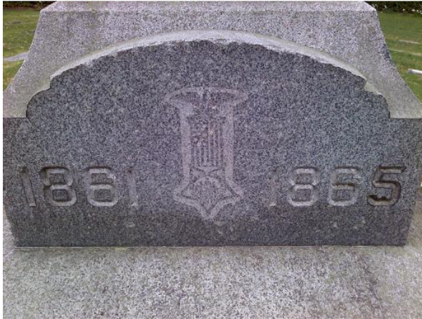
The years of the Civil War with an image of the Medal of Honor.