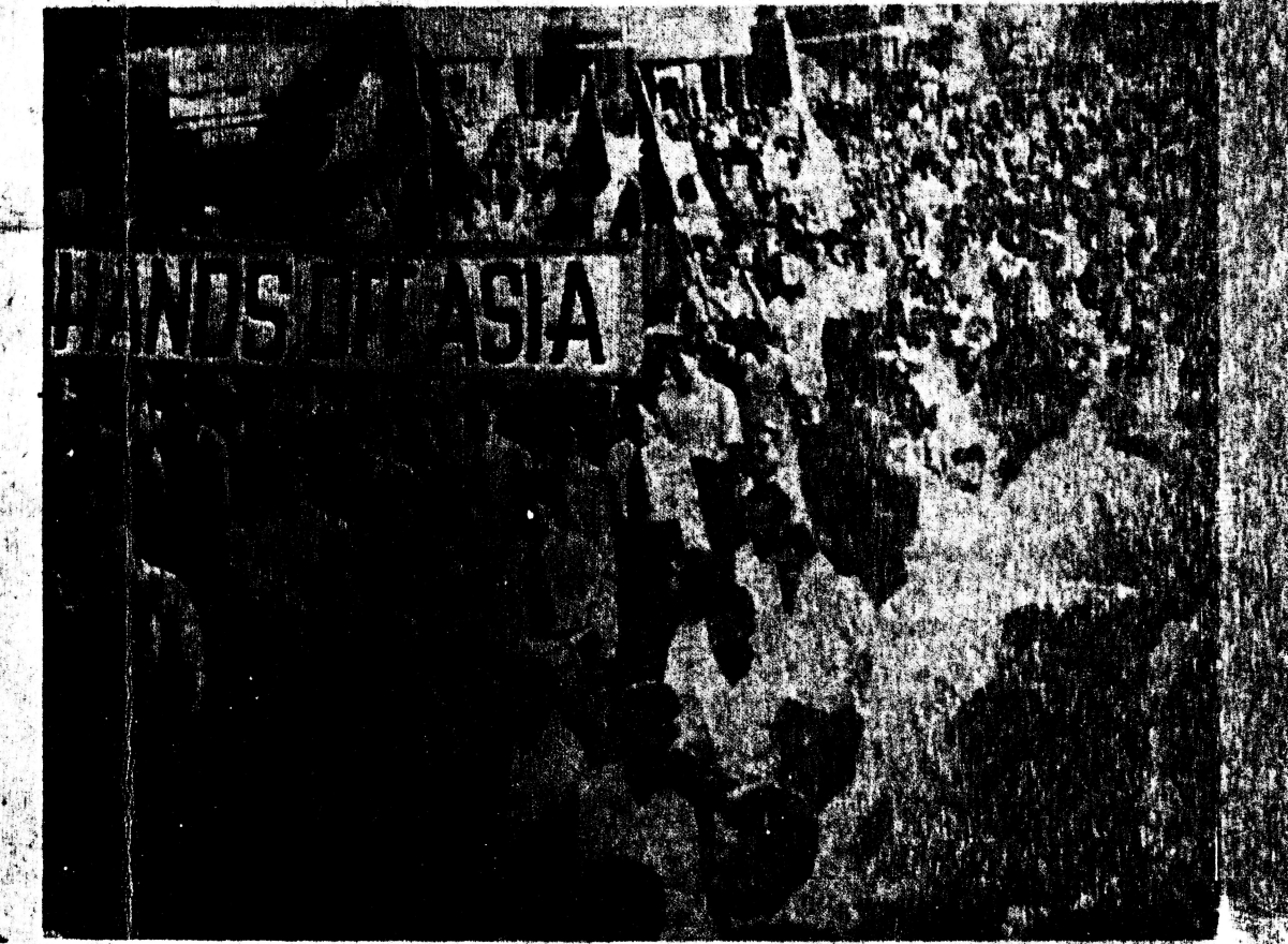
Part of the "Hands Off Asia" Demonstration.

The Youth Conference at Calcutta symbolised another Act, not of the upper-class