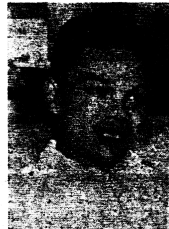
Than Tun, General Secretary, Burmese Communist Party

Owing to our shortcomings and weaknesses, we were out-manoeuvred, and since September 1946, the national bourgeoisie leadership inside the AFPFL began to compromise with imperialism. This compromise was finalised in