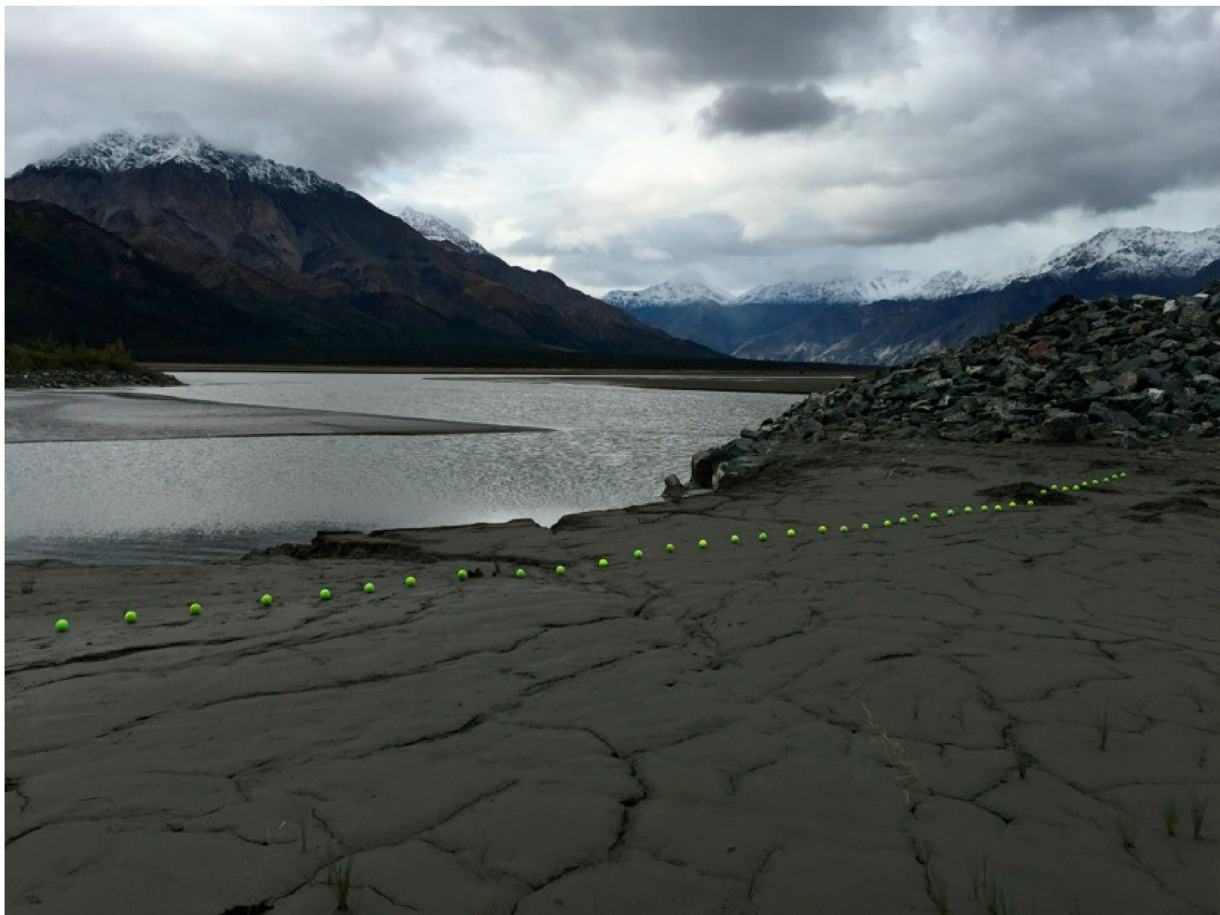
Figure 6. 'Metaphor' – Slims River reduction. This art installation accentuates the lines of the dried Slims River bed. Art image © 2016 K.A. Colorado.