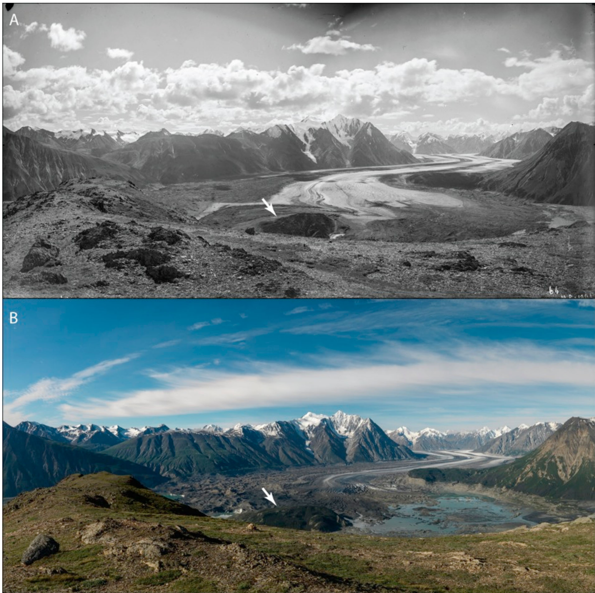
Figure 3. Historic and modern photographs of Kaskawulsh Glacier terminus. (A) Photo panorama taken by Dominion Land Surveyor James Joseph McArthur in 1900. (B) Photo panorama taken at the same location as (A) by the Mountain Legacy Project ( http://explore.mountainlegacy.ca/ ) in 2012. Both panoramas comprise multiple high-resolution photographs. Note the presence of the bedrock hill described in the text, annotated with white arrows. The historic image is archived in the Library and Archives Canada/Bibliothèque et Archives Canada ( http://www.bac-lac.gc.ca/eng/Pages/home.aspx ). The images are used under a Creative Commons Attribution-NonCommercial 4.0 International License. A slider comparison is available at http://tinyurl.com/ya2nzlky