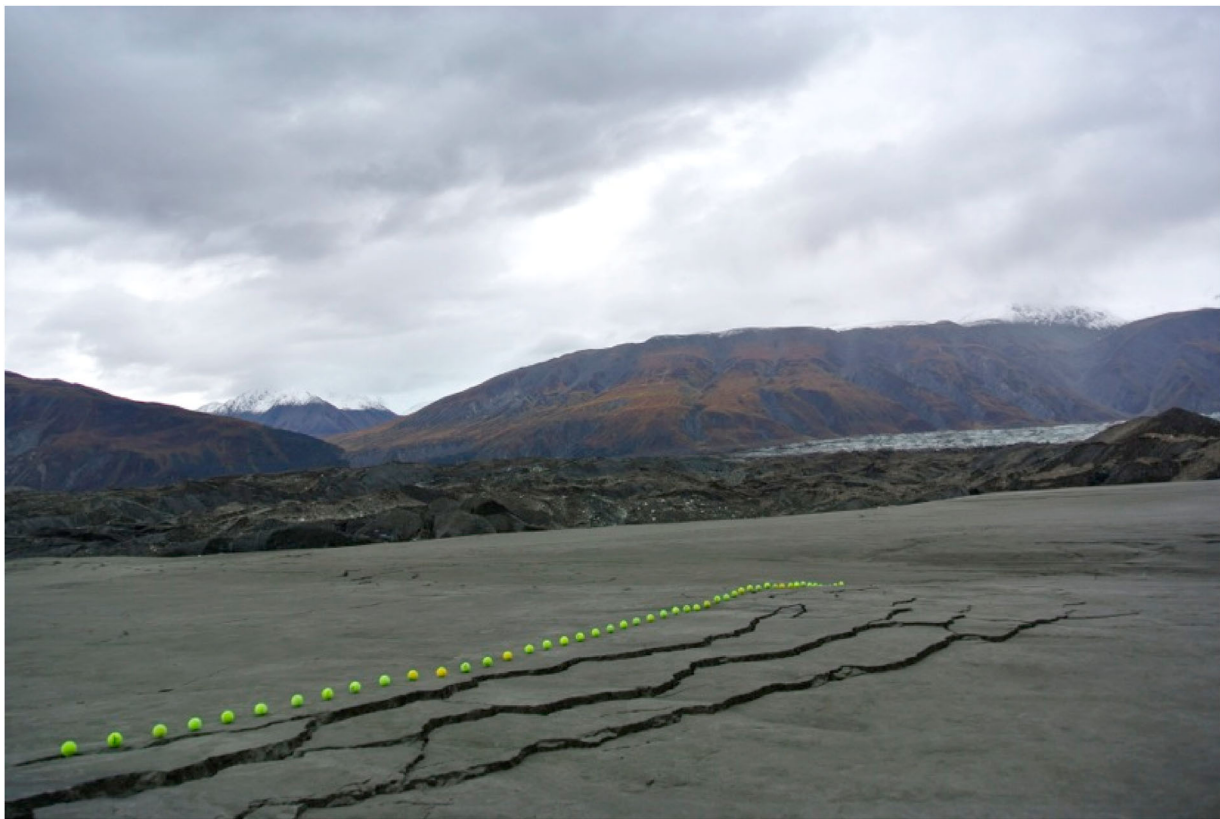
Figure 11. ‘Surface Breach’ – bordering the glacier. This art installation parallels the mud cracks along the floor of Slims valley, beneath which lies dead glacier ice. Art image © 2016 K.A. Colorado.