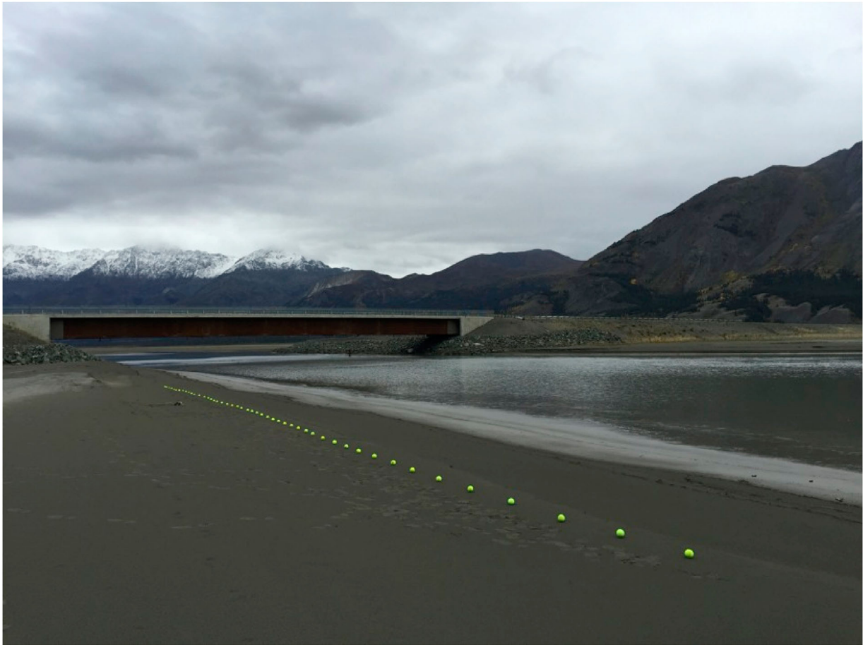
Figure 9. 'Bridge Flow' – line along the reduced Slims River at Kluane Lake. The art installation's metaphoric boundary line symbolically delineates the border of the vanished river. Art image © 2016 K.A. Colorado.