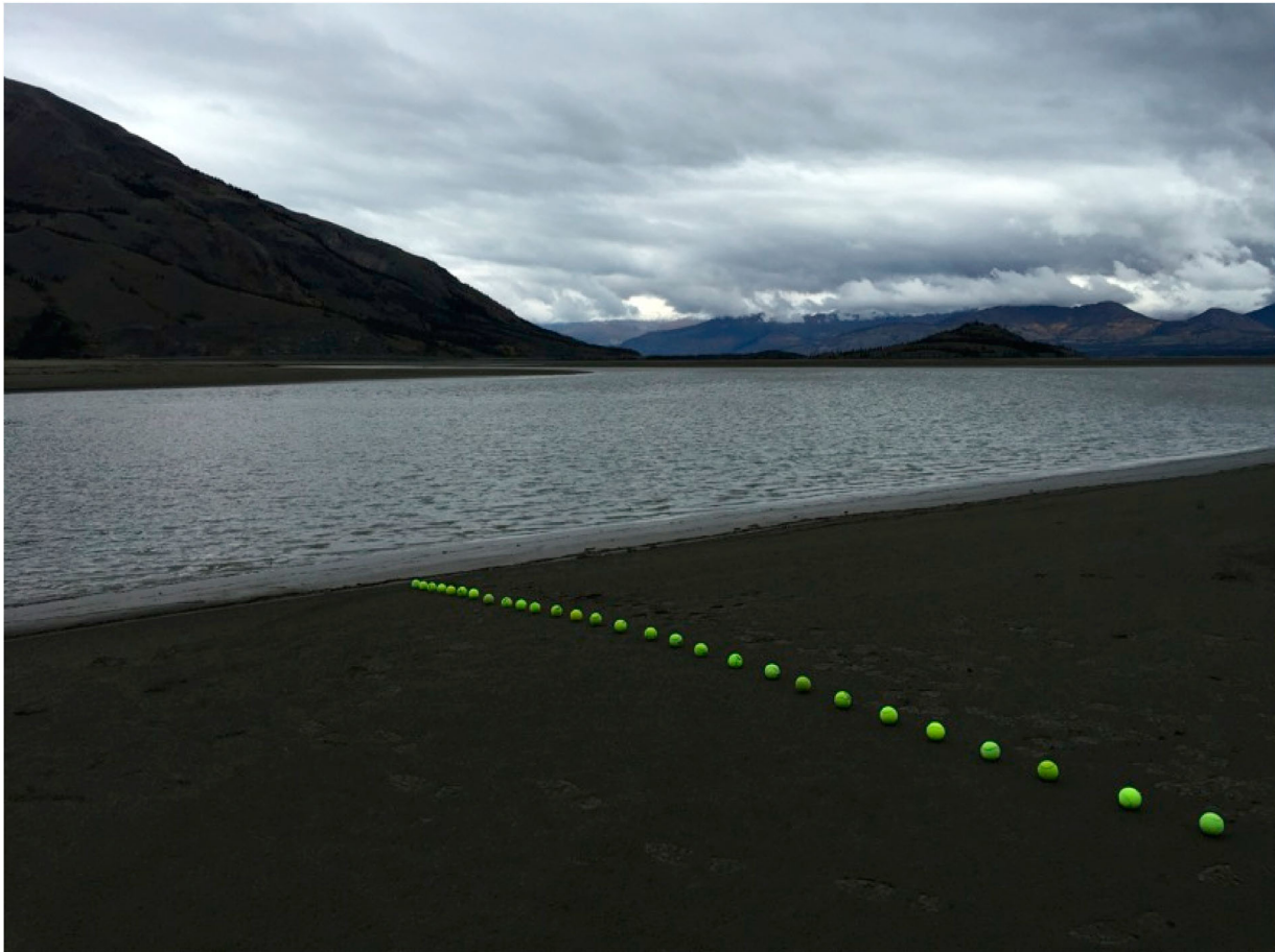
Figure 8. 'Horizon Drain' – the edge of Slims River looking toward Kluane Lake. The line of balls sits on the bed of the former river and contrasts with the horizon in the distance. Art image © 2016 K.A. Colorado.

that Constable painted his skies with a scientific method, with his range of cloud studies attempting to encapsulate a broad and representative sample of the population under consideration.