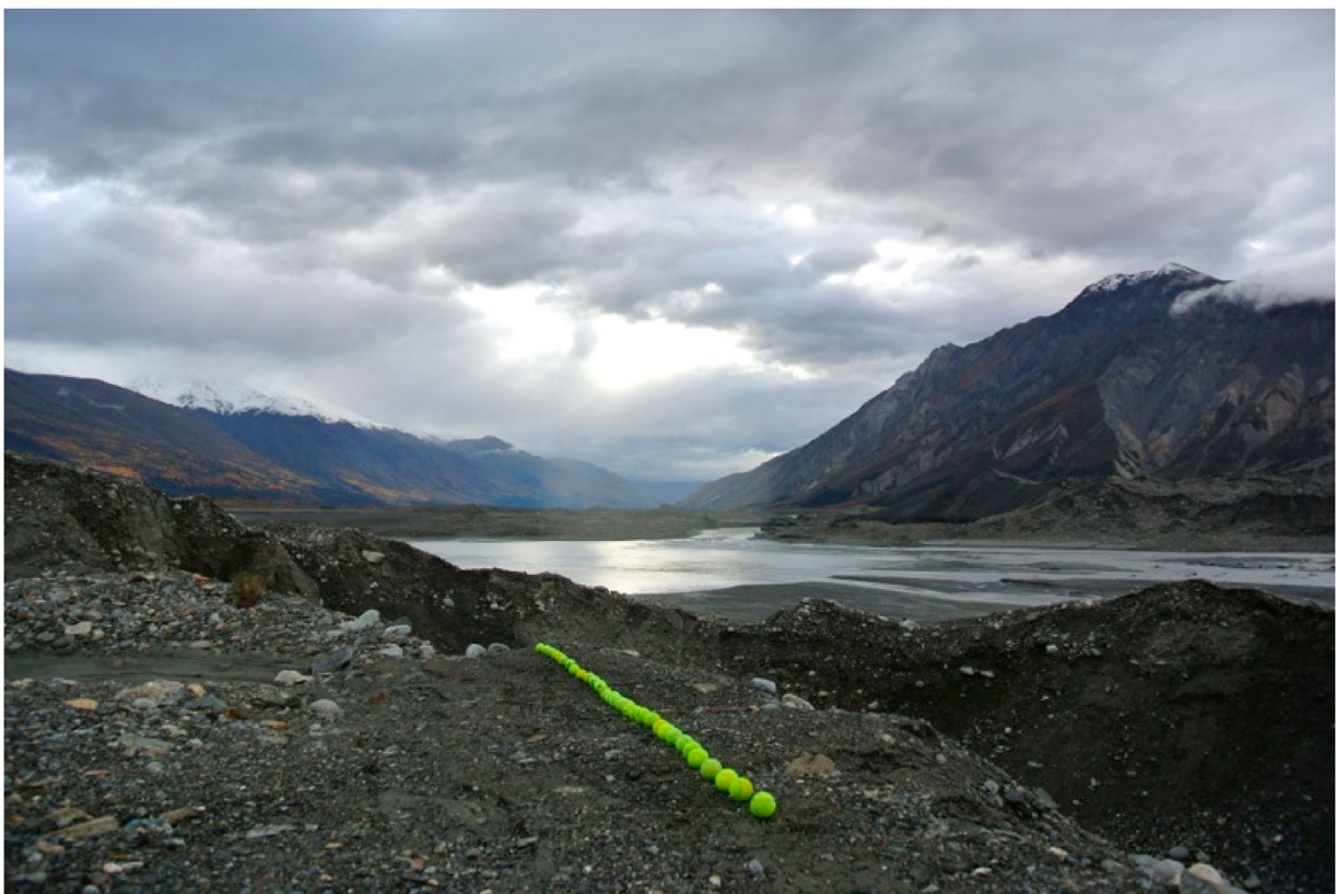
Figure 10. 'Dominion' – boundary line to the glacier. The art installation is positioned in an area of sediment covering the dead toe of Kaskawulsh Glacier. Light from the sky reflects from the remnant of Slims Lake, creating a silhouette of the mountain range. Art image © 2016 K.A. Colorado.