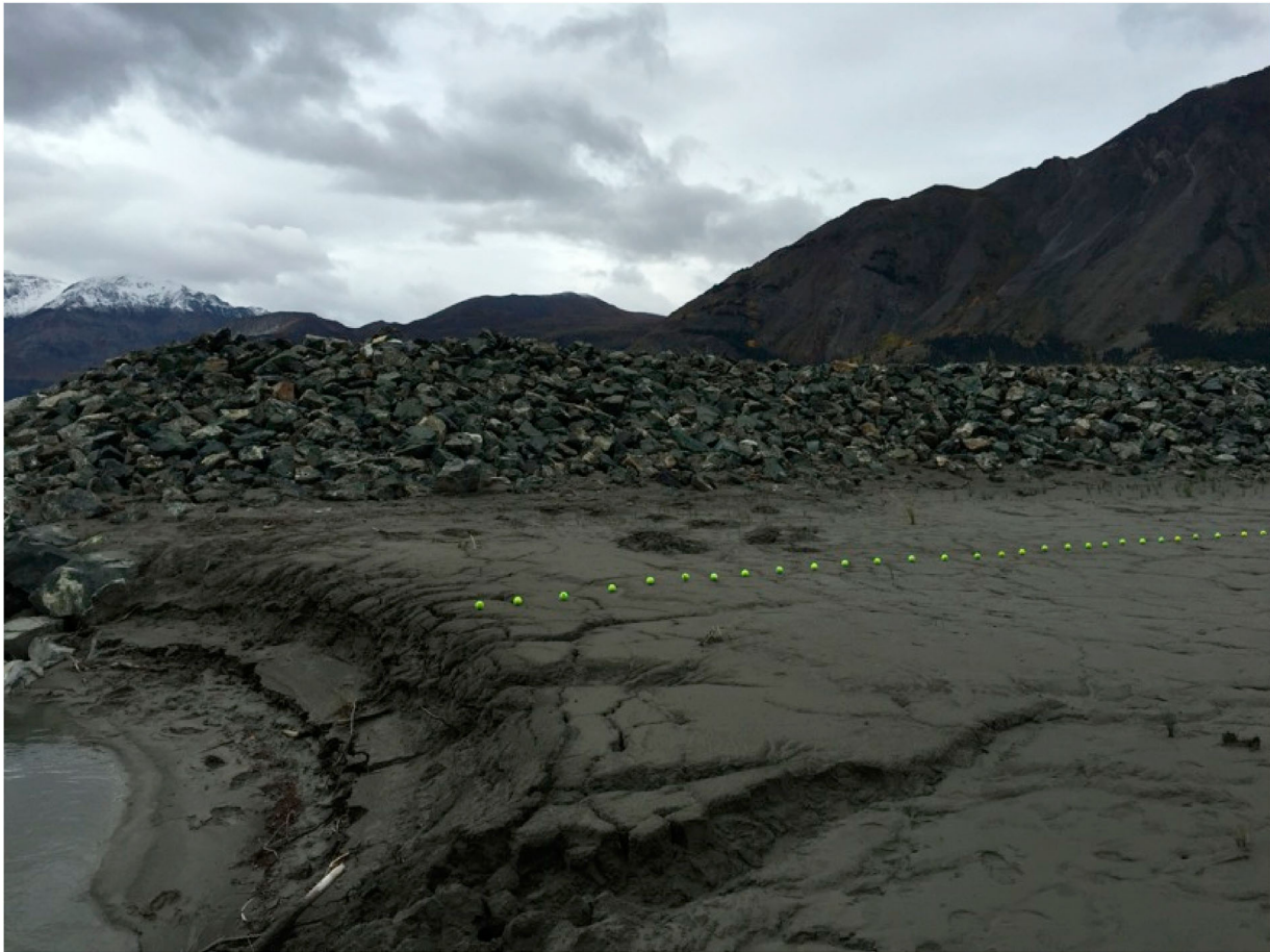
Figure 7. 'Termination/subordination' – Slims River bank. This art installation points toward the former Slims River edge. Art image © 2016 K.A. Colorado.

yellow-green color of each ball arranged in sequence was an artistic device intended to amplify the surrounding earth features observed and quantified in our geomorphological study.