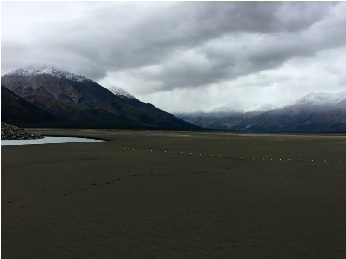
Figure 4. 'Goodbye Slims' – Slims River valley view. This art installation leads the viewer's eyes to the former channel of Slims River, which was abandoned due to retreat of Kaskawulsh Glacier. Art image © 2016 K.A. Colorado.