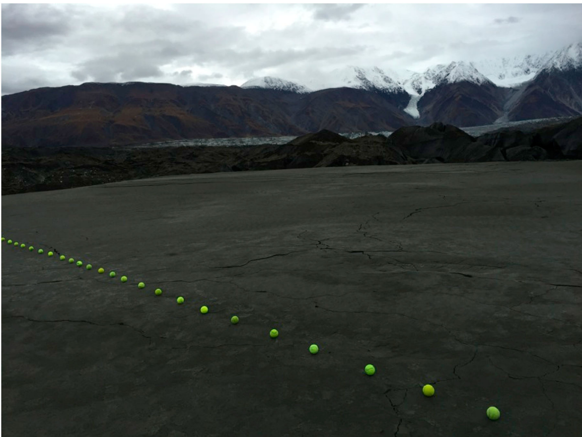
Figure 5. 'Yukon Flux' – view up Slims River valley to Kaskawulsh Glacier. The fluorescent balls contrast with the dark surface, emphasizing the instability of the ice that lies below. Art image © 2016 K.A. Colorado.