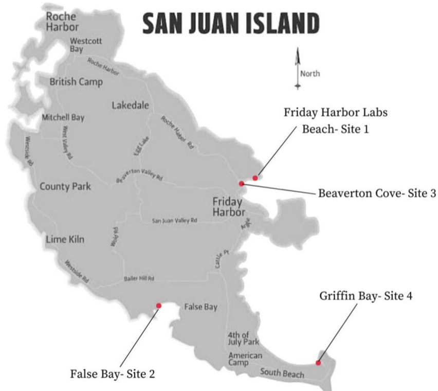
Figure 1. Map of survey sites on San Juan Island, Washington, including: Friday Harbor Labs Beach (48.54635°N, 123.00981°W), False Bay (48.48307°N, 123.07452°W), Beaverton Cove (48.54509°N, 123.01579°W), and Griffin Bay (48.46271°N, 122.97286°W).

intended to exclude those oysters that were already dead or not yet present at the time of the heat dome. For each individual we recorded whether the oyster was living or dead, and measured total length across the longest axis using digital calipers (cm).