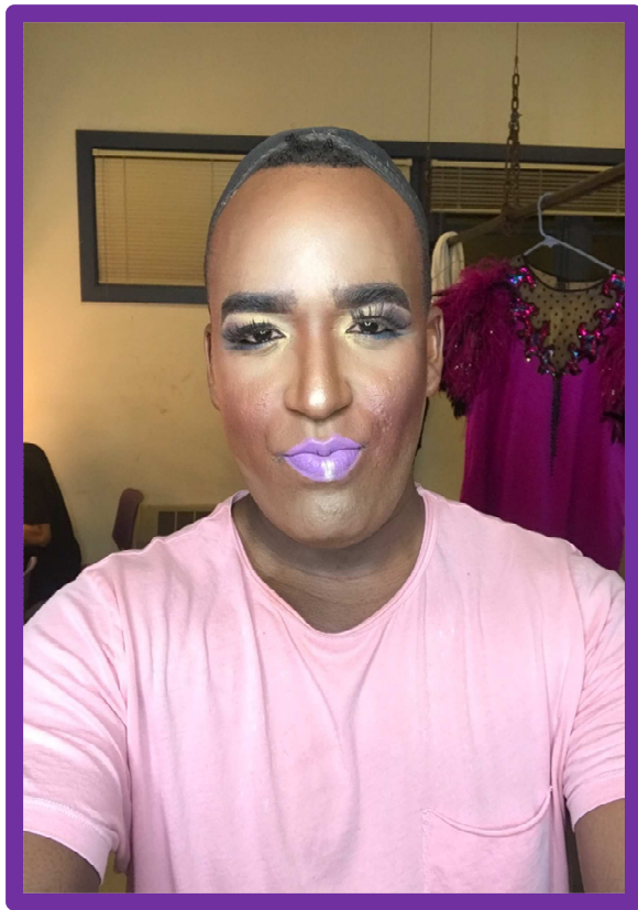
Backstage – Dress rehearsal for 3 rd year solo show – Penthouse Theatre UW, 2018

Make Up Artist, Penthouse Theatre UW 2018