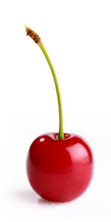
Cherry – a sweet fruit.