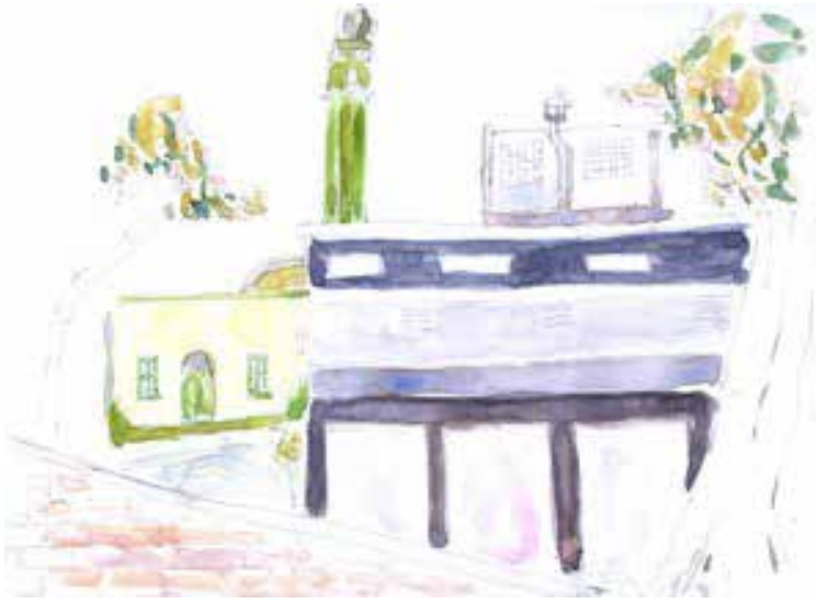
A mosque and commercial building in Bo Kaap, a historically Muslim neighborhood on the edge of Cape Town's CBD.

of town and taken some photos and made a painting; walked along the bus station and talked to vendors. What, exactly, could fill all of this time over the next few weeks? Had I already seen what I had come to see?