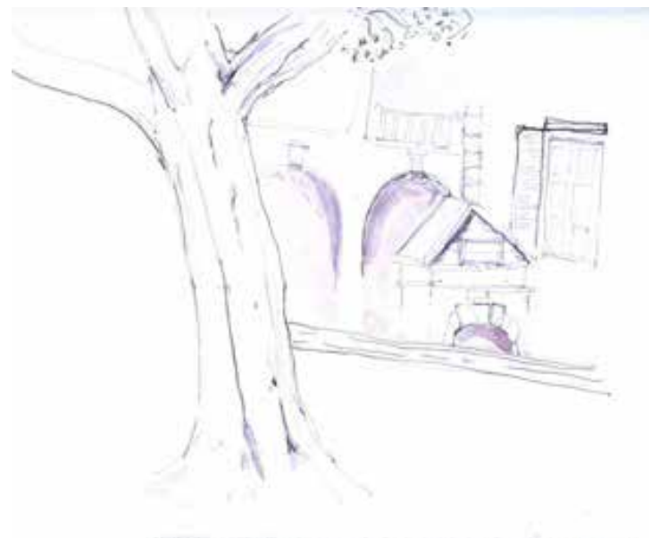
Company Gardens with colonial-era government buildings.

These bookends, for me, highlight how much happened during these three weeks. Though it perhaps should have been obvious to me, I realized that Cape Town, and the Western Cape in general, is much bigger than the small cluster of CBD neighborhoods that most tourists frequent. There are myriad more neighborhoods, some cleared and some growing; some Black and some White; some dating