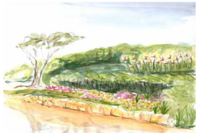
A bucolic scene at Kirstenbosch, with Jan van Riebeeck's hedge in the background.