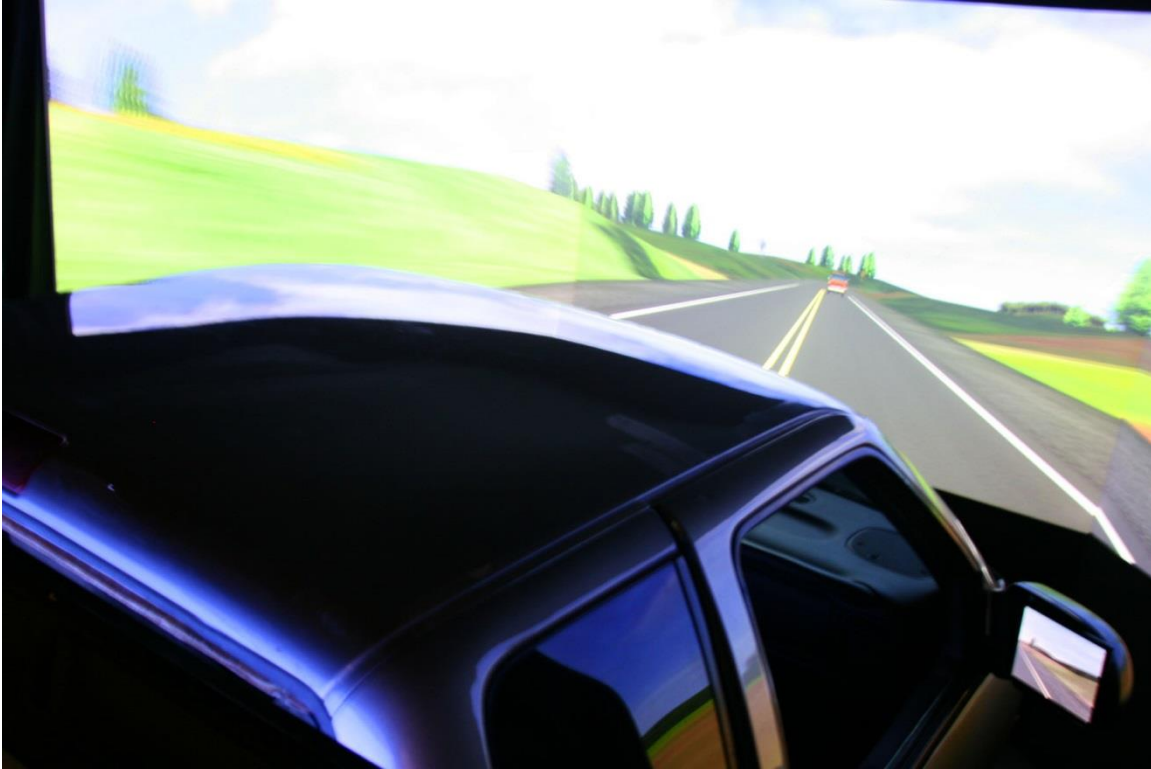
Figure 5.1 Overhead view of Chevy S-10 simulator cab