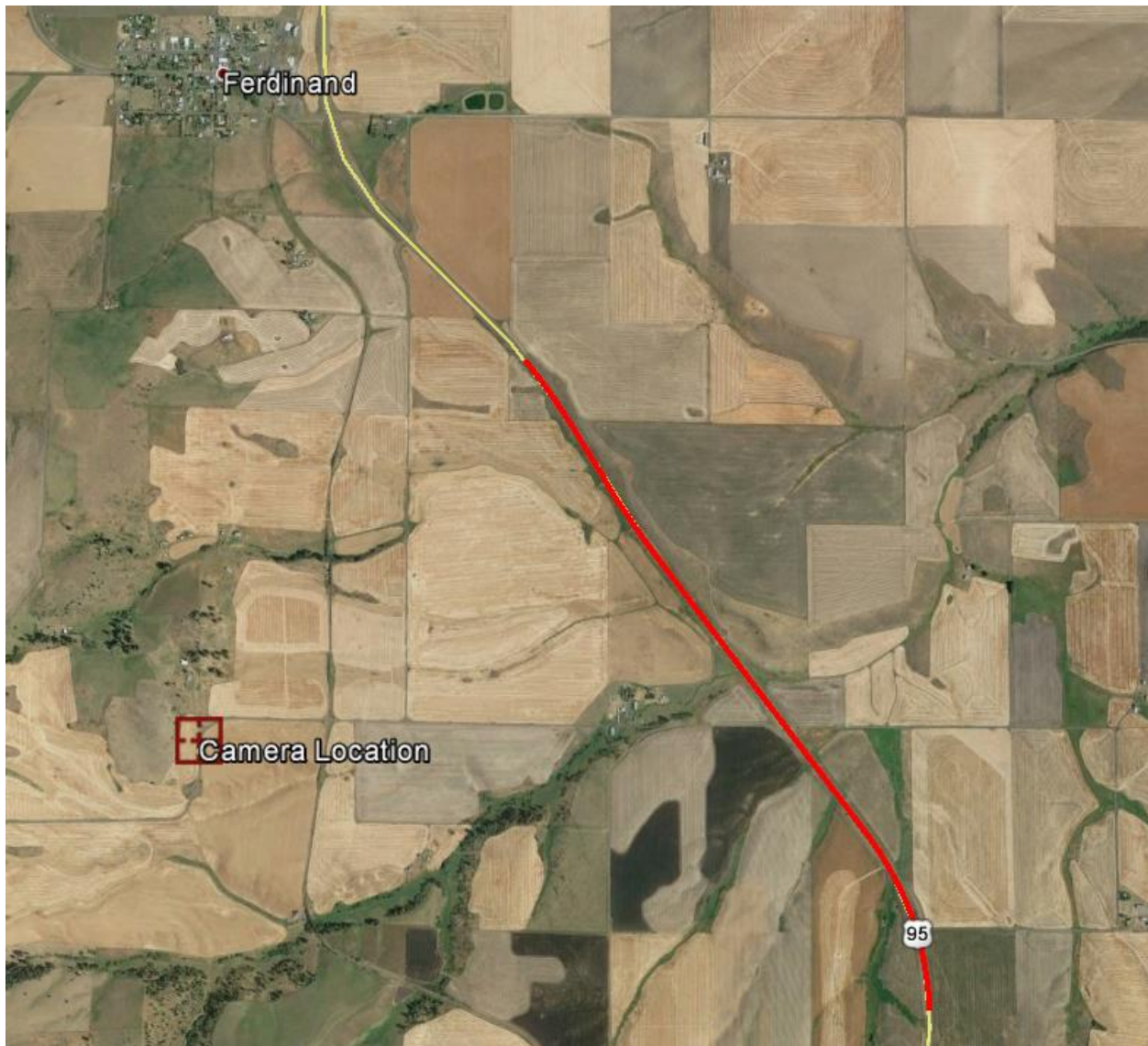
Figure 3.1 Ferdinand Segment Location

Field data were obtained from video footage collected from an approximately 2 mile two-lane rural highway segment of U.S. 95 near Ferdinand, Idaho, illustrated as the red line in Figure 2. Video was collected from roughly 3:50 pm to 6:15 pm on a Friday in September 2013 using two 640x480 resolution cameras that were directed at the roadway (see Figure 3.1).