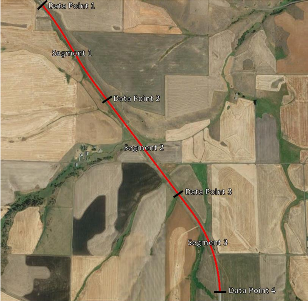
Figure 3.2 Study Segment Data Points and Segments

Vehicle trajectories were constructed by recording the time each vehicle passed four data collection points along the study segment. These four points are shown in Figure 3.2. Highway geometry information for each segment between data points is provided in Table 1.