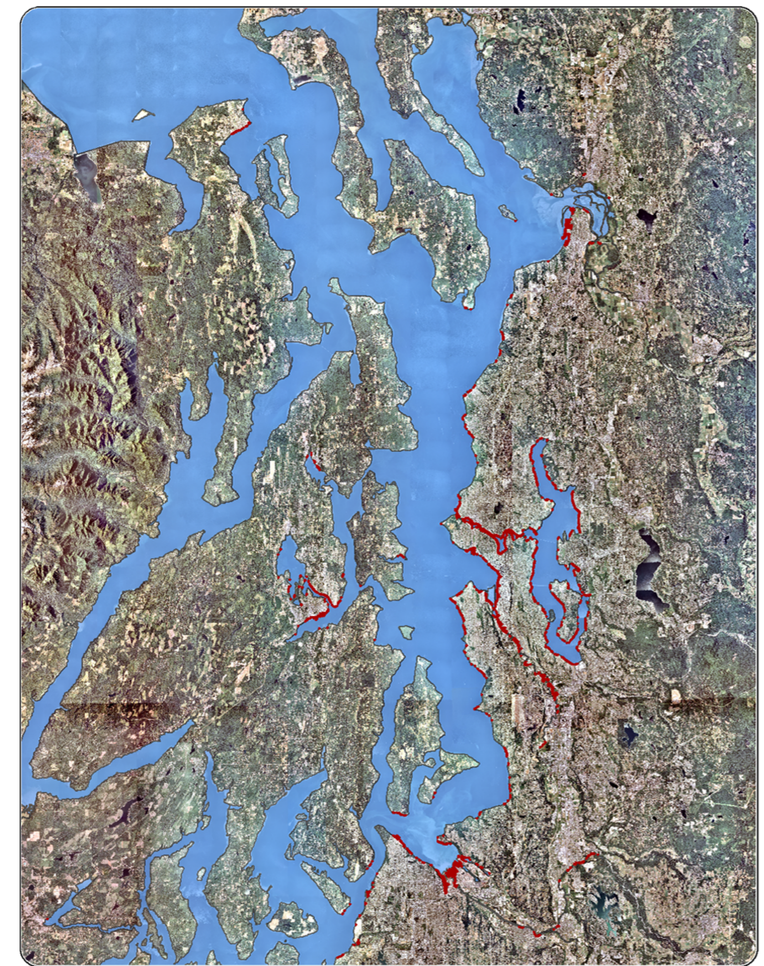
Puget Sound Pollution Hazard Zones (in red)

The planning process began with receiving shellfish poisoning data from a faculty member, Cheryl Greengrove. The original plan was to utilize this data with Puget Sound water quality data in a raster analysis and to create a base map to accomplish this analysis within. However, spatial coordinates for the dataset were not available. Upon further discussion, the focus of the project turned to developing a substantial base map for the Puget Sound. This base map would include layers from the built environment and natural environment. The built environment facet would include a population density raster and a development layer. The natural environment facet would include a combined topography and bathymetry layer and a land cover layer. Preliminary speculation pointed to government agencies as sources of relevant data. Universal Transverse Mercator was selected as the coordinate system because it was able to cover the entire extent of the Puget Sound. An additional element of analysis was added to the project through brainstorming with my small group. This analysis would include impervious surfaces, slope, and population density to determine potential pollution hazard zones to the Puget Sound.