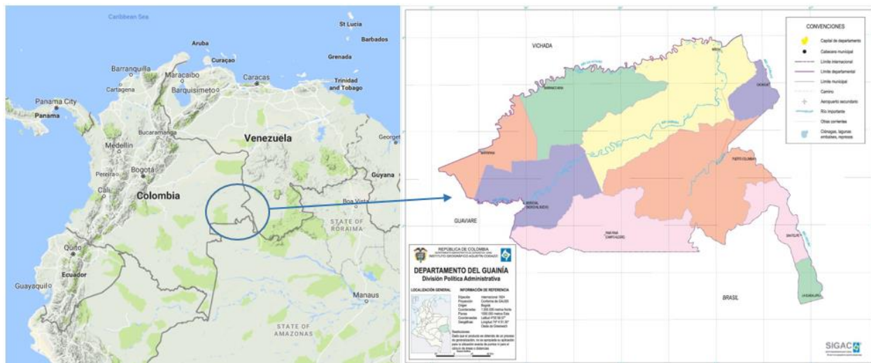
Figure 1. Province of Guainía

according to MOH (2018b). These challenges are observed in the precarious health situation of the region by showing significant discrepancies on health indicators when compared to the general population (see table 1). Additionally, recent reports highlighted the high prevalence (see table 2) to certain neglected tropical infectious diseases (NTDs) in disperse indigenous populations that could impact growth and cognitive development (Sinergias, 2018). The MOH (2013) estimates about two thirds of the population in Guainía is at high risk to contract an NTD. This situation is also fueled by the economic disparity indigenous populations living in disperse areas are exposed to. According to the government of Guainía (2012), 75% of disperse populations live under the poverty line while 23% of those live under extreme poverty. These numbers may increase due to the current influx of displaced populations fleeing from the sociopolitical turmoil Venezuela is currently experiencing. These adversities capture the current challenge delivering primary health care to disperse areas in Guainía.