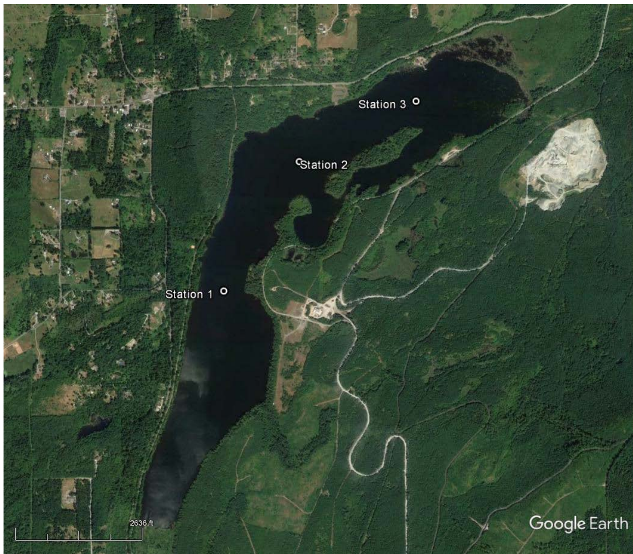
Figure 1: Map of Lake Kapowsin showing UWT sampling locations.

Sampling was conducted by UWT staff once a month from three stations located along the center line of the lake [Figure 1] from June-October 2016. The parameters listed below were collected at each station once a month.