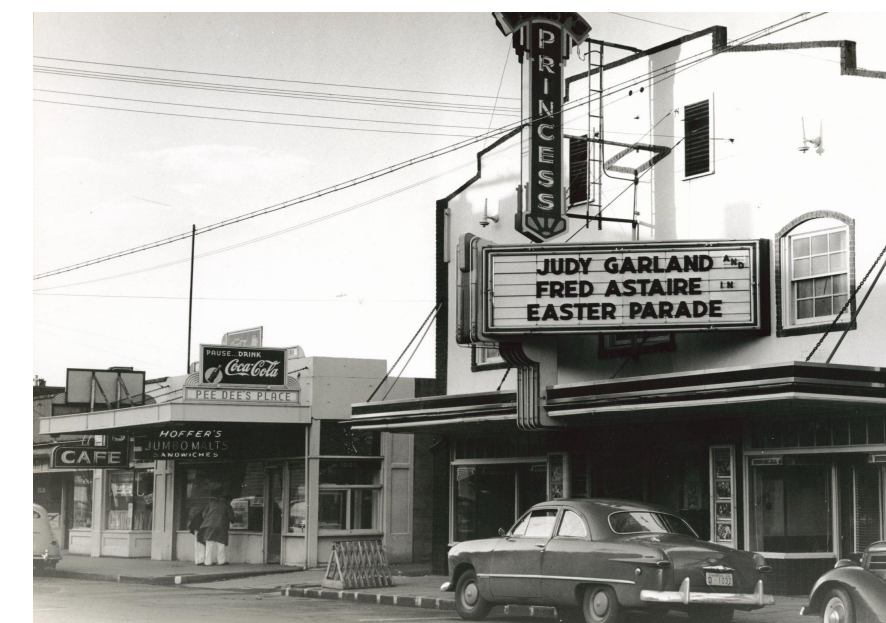
Princess Theatre in 1949. Playing Judy Garland & Fred Astaire in "Easter Parade."

A multidimensional, self-guided, web-based walking tour accessible on any internet connected device. It features real world locations, complete with educational audio and text that incorporates historic photos and excerpts from oral histories.