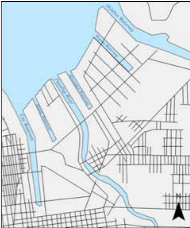
Map 5: This map outlines the contemporary port and main urban area in Tacoma. Note in particular the waterways in relation to the original and natural tideflats.