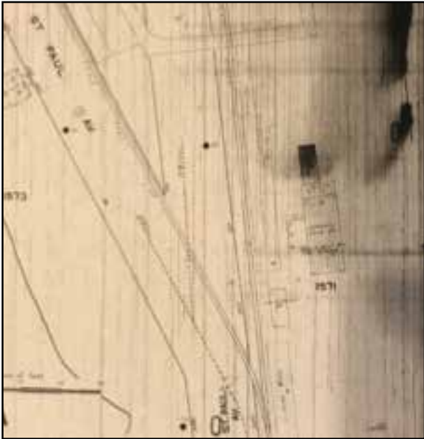
MAP 2: This 1912 Sanborn Fire Insurance Map from Tacoma, Pierce County, Washington shows St. Paul Avenue and depicts 9 of the 14 houses, the Japanese Boarding House, another boarding house, dining room, commissary, and laundry.