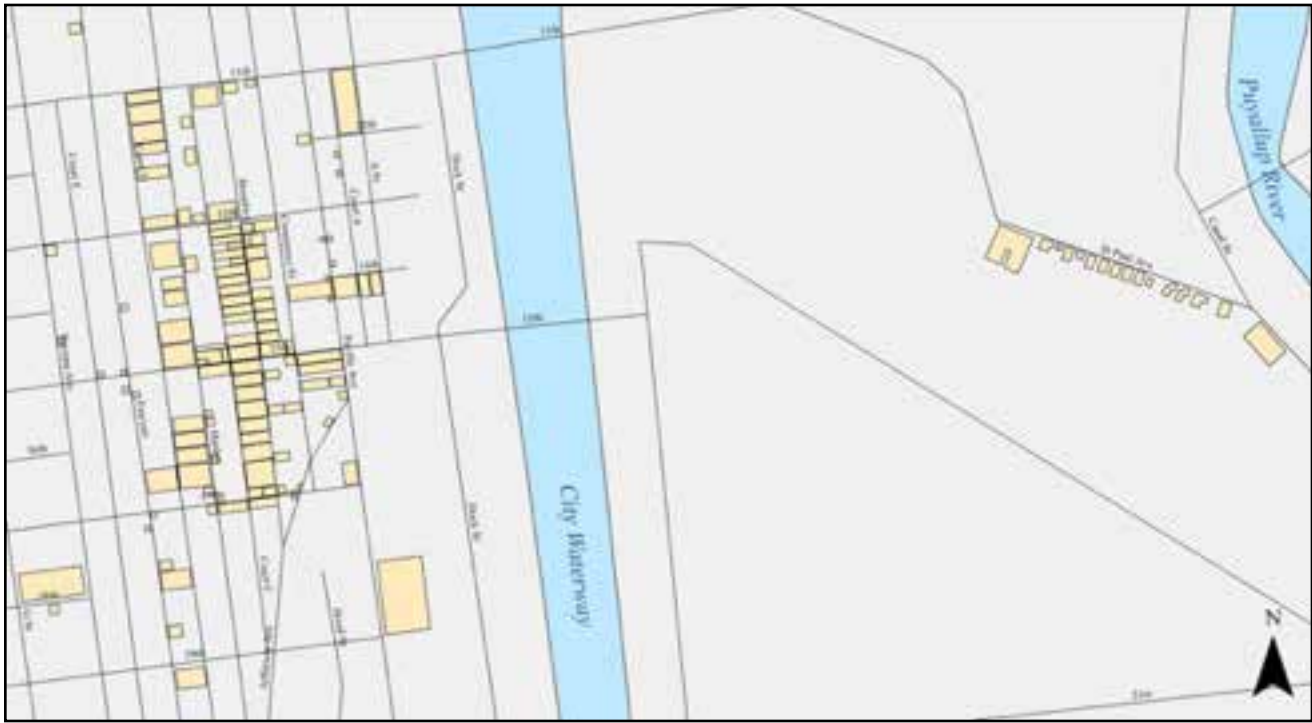
MAP 1: This map shows the relationship between the downtown core of Japanese businesses and residences and the houses on St. Paul Avenue that were across the street from the St. Paul & Tacoma Lumber Company operations.