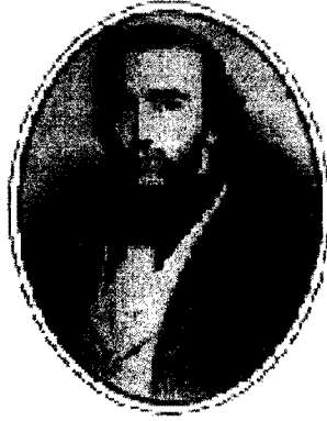
Adolphe Sax (1814-1894)