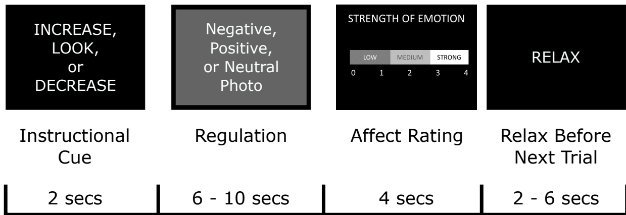
Figure 1: Schematic Diagram of the task with cue, stimulus, rating, and ITI stages. (McLaughlin, Peverill, Gold, Alves, & Sheridan, 2015)

periences, including physical and sexual abuse, and has demonstrated excellent inter-rater reliability for maltreatment reports and high agreement between siblings on reports of maltreatment (Bifulco, Brown, Lillie, & Jarvis, 1997). a composite maltreatment score was then calculated for each participant from the sum of the physical and sexual abuse scales of the CTQ.