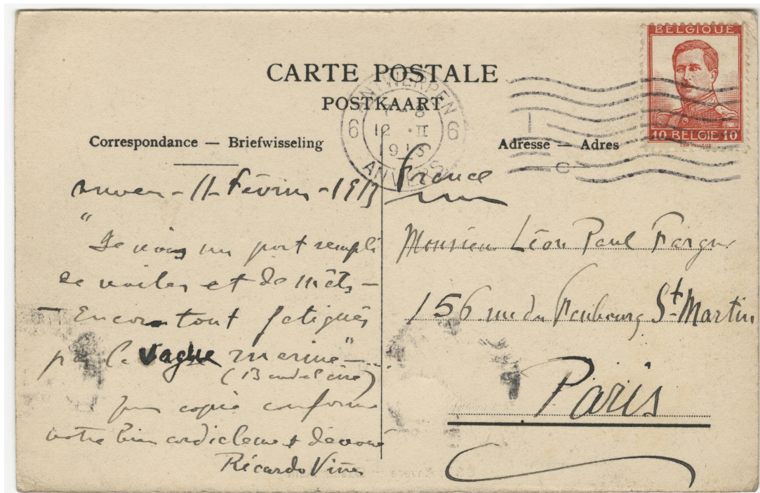
Figure 3: Postcard of Anvers (Antwerp) Port (from Ricardo Viñes to Léon-Paul Fargue)