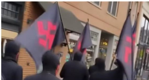
Neo-Nazis march through Columbus, Ohio. 2024.

It would have been wonderful if Captain America could have ended antisemitism with that famous punch to Hitler as seen on the cover of Captain America #1 . Sadly we live in no such reality; the hydra grew another head so to speak. We have witnessed antisemitism spike in the United States by nearly 400% since 2023. xliiii In August of 2023 an armed man opened fire outside a Jewish school after he was unable to gain entry. xliiv In November of 2024 we watched neo-Nazis march through Columbus, Ohio. xliv