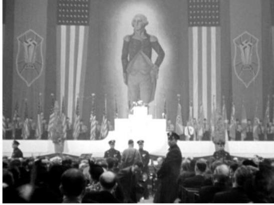
Bund rally in Madison Square Garden, 1939. Image of George Washington flanked by Swastika banners.

fascist America. iv They were the most influential of the American Nazi groups and spread antisemitic propaganda that “claimed Jews were the enemies of both Germans and Americans. Bund members promoted the lie that Jews were conspiring to control politics, economics, the media, and other areas of society.” v The Bund organized everything from