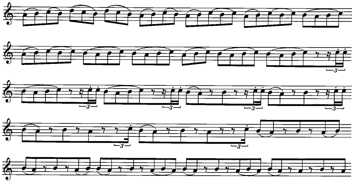
Example 2: Introduction of Motive B1 and preceding material Strung Out

at 0:54, Glass introduces B 4 into fragmented scale, followed soon by A 4 at 1:06. Following this Glass unsystematically explores the space between A 4 and E 5 , focusing by turns on descent, undulation, and ascent, sometimes restricting the range to exclude D 5 and E 5 . In the second line of the third page, at 1:49, the music moves away from E 5 for the last time in this section; in the fourth line, at 1:58, D 5 is removed, reducing the melodic content to a three-note scale fragment starting on A 4 . Here the music arrives at the only other content that serves as an easily distinguished motive: Glass breaks the steady stream of eighth notes to introduce the first version of a stuttering motive shown in Example 2, to which we will refer as Motive B1 (consisting of --- C 5 -B 4 -A 4 -B 4 -C 5 , with the initial C 5 usually repeated in sixteenth notes). This figure also