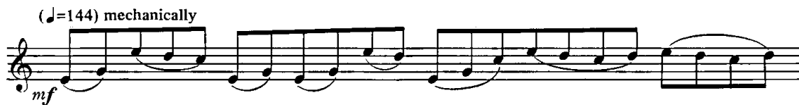
Example 1: Motive A and its immediate continuation Strung Out

By the second line of the second page of the score, Glass has abandoned Motive A (until its return just before the da capo). The last version of Motive A comes at around 0:51. After this point all that remains of Motive A is a small scalar fragment spanning from C 5 to E 5 . Soon after,