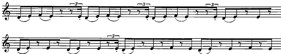
Example 3: Introduction of Motive B2 Strung Out

The extension of the scale back up to E 5 is not systematic but also not immediate; First A 4 returns, then B 4 , but then the music quickly jumps up to E 5 , with the ascending octave scale