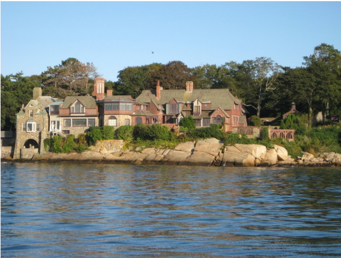
Item IX: Photograph of Beauport, the Sleeper-McCann House