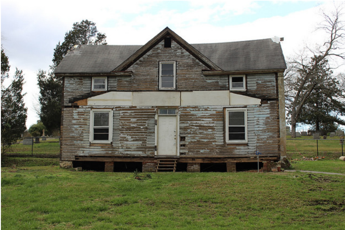
Item XI: Photograph of the home childhood home of Pauli Murray